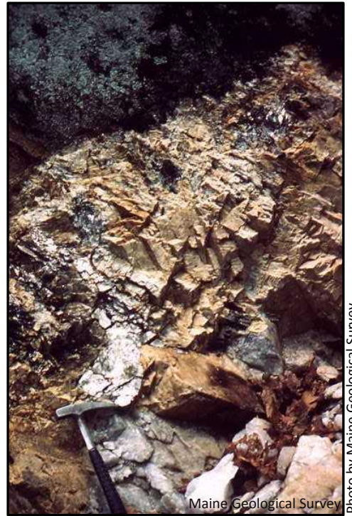
Figure 1. Pegmatite vein in Stoneham, Maine, showing large masses of milky quartz, pink microcline feldspar, and shiny muscovite mica.

The 2006 Maine Mineral Symposium had a talk and exhibits focusing on huge crystals of minerals from Maine. The mineral particles that form ordinary rocks are usually very small and may not be easy to see or identify, but in certain cases they are much larger. The best known examples in Maine are found in a coarse-grained variety of granite called "pegmatite." This igneous rock is composed mostly of ordinary quartz, feldspar, and mica (Figure 1).