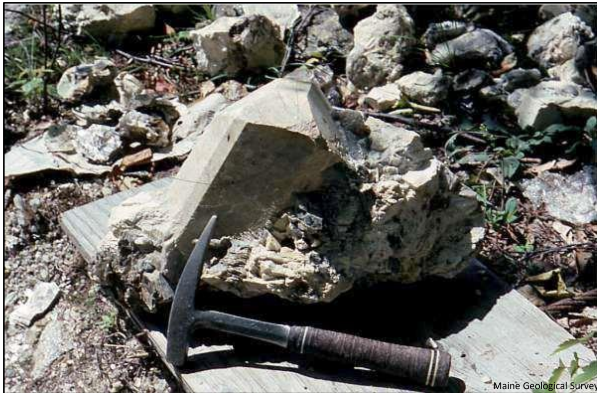
Figure 3. Feldspar crystal found at the Aldrich Quarry, Stoneham, Maine.

Less commonly, some of these crystals managed to reach extraordinary sizes (Figures 3-4). If you are the lucky discoverer of such large crystals, you may need to exercise much care and patience with the use of heavy tools to extract them with as little damage as possible. Ideally, any crystal looks best if some of its original host rock is still attached.