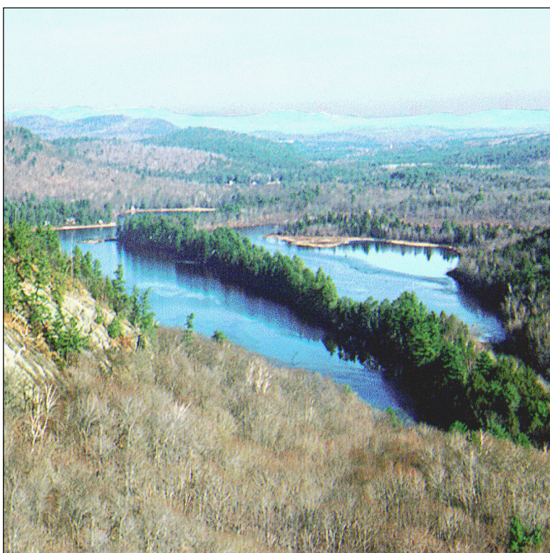
Figure 5: Esker cutting across Kezar Five Ponds, Waterville. The ridge consists of sand and gravel deposited by meltwater flowing in a tunnel beneath glacial ice.