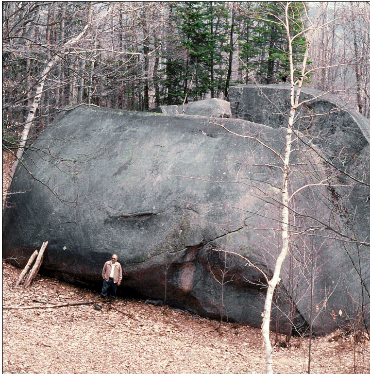
Figure 2: Dagget's Rock in Phillips. This is the largest known glacially transported boulder in Maine. It is about 100 feet long and estimated to weigh 8,000 tons.