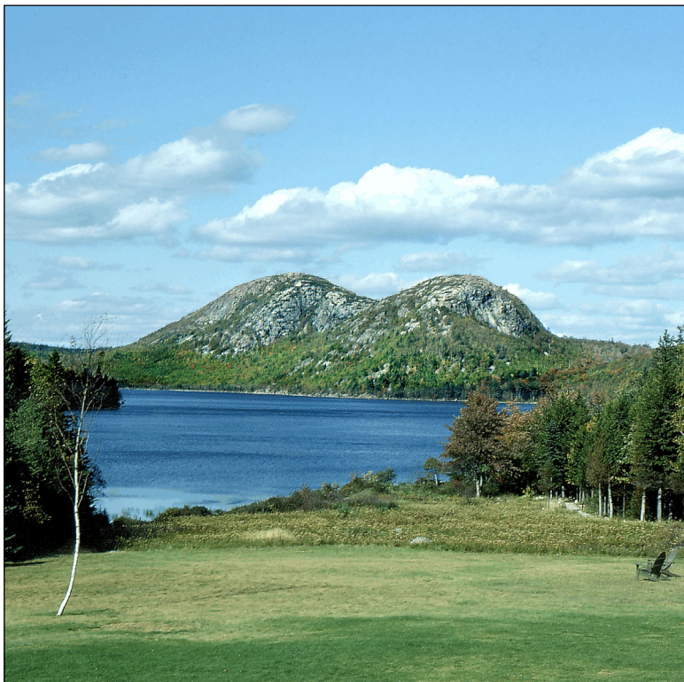
Figure 1: "The Bubbles" and Jordan Pond in Acadia National Park. These hills and valleys were sculpted by glacial erosion. The pond was dammed behind a moraine ridge during retreat of the ice sheet.