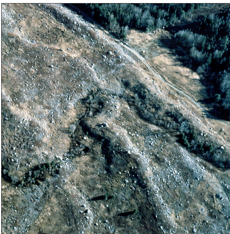
Figure 6: Aerial view of moraine ridges in blueberry field, Sedgwick (note dirt road in upper right for scale). Each bouldery ridge marks a position of the retreating glacier margin. The ice receded from right to left.