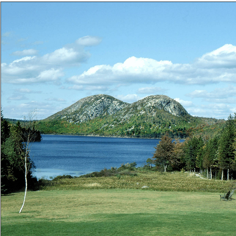
Figure 1: "The Bubbles" and Jordan Pond in Acadia National Park. These hills and valleys were sculpted by glacial erosion. The pond was dammed behind a moraine ridge during retreat of the ice sheet.