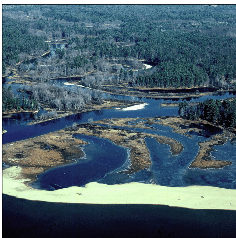
Figure 8: Songo River delta and Songo Beach, Sebago Lake State Park, Naples. These deposits are typical of geological features formed in Maine since the Ice Age.