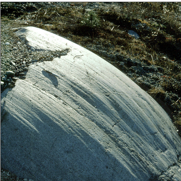
Figure 3: Granite ledge in Westbrook, showing polished and grooved surface resulting from glacial abrasion. The grooves and shape of the ledge indicate ice flow toward the southeast.