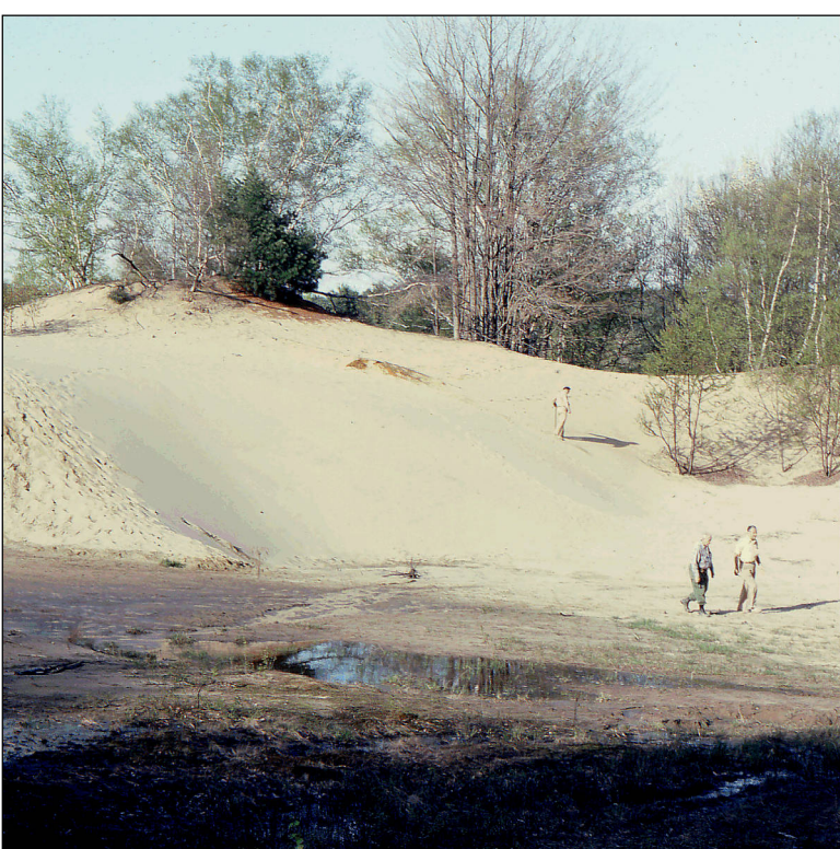
Figure 7: Sand dune in Wayne. This and other "deserts" in Maine formed as windstorms in late-glacial time blew sand out of valleys, often depositing it as dune fields on hillsides downwind. Some dunes were reactivated in historical time when grazing animals stripped the vegetation cover.