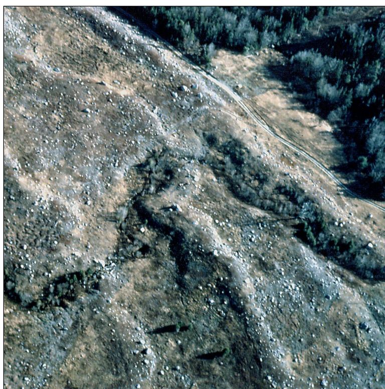
Figure 6: Aerial view of moraine ridges in blueberry field, Sedgwick (note dirt road in upper right for scale). Each bouldery ridge marks a position of the retreating glacier margin. The ice receded from right to left.