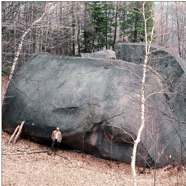
Figure 2: Daggett's Rock in Phillips. This is the largest known glacially transported boulder in Maine. It is about 100 feet long and estimated to weigh 8,000 tons.