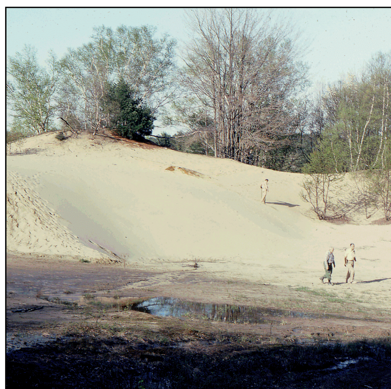
Figure 7: Sand dune in Wayne. This and other "deserts" in Maine formed as windblown in late-glacial time blew sand out of valleys, often depositing it as dune fields on hillsides downwind. Some dunes were reactivated in historical times when grazing animals stripped the vegetation cover.