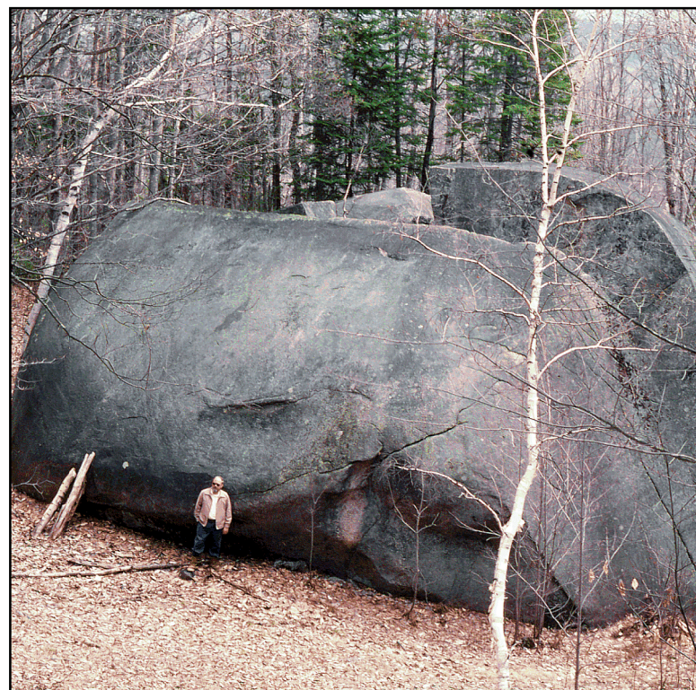
Figure 2: Daggett's Rock in Phillips. This is the largest known glacially transported boulder in Maine. It is about 100 feet long and estimated to weigh 8,000 tons.