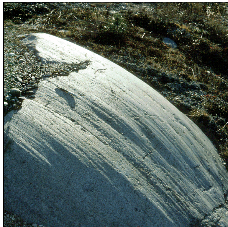
Figure 3: Granite ledge in Westbrook, showing polished and grooved surface resulting from glacial abrasion. The grooves and shape of the ledge indicate ice flow toward the southeast.