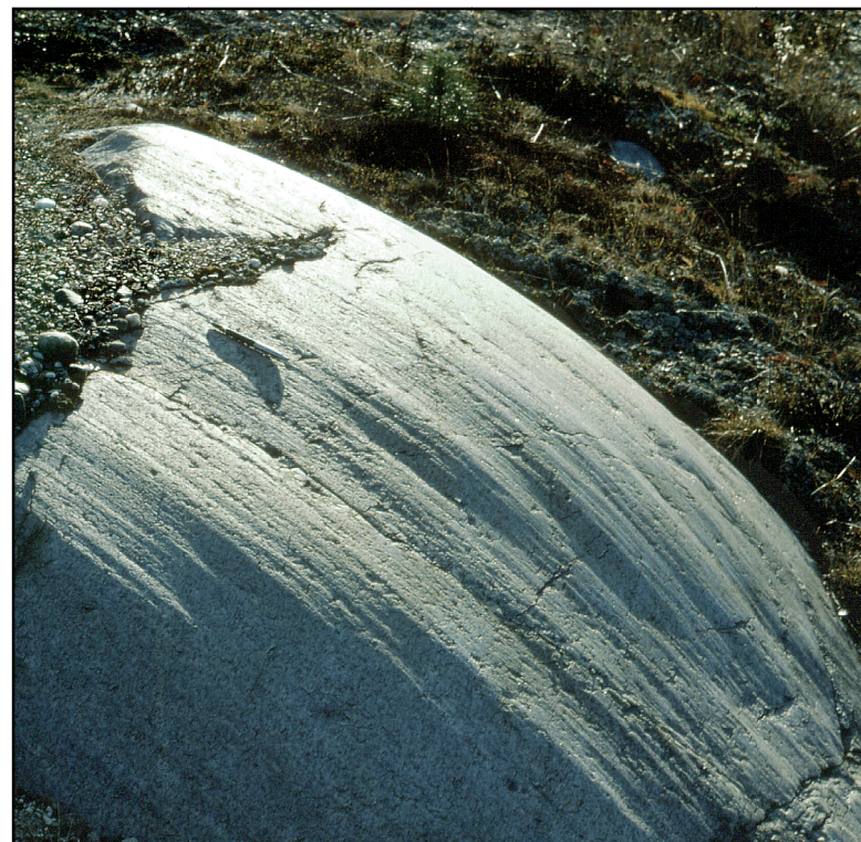
Figure 3: Granite ledge in Westbrook, showing polished and grooved surface resulting from glacial abrasion. The grooves and shape of the ledge indicate ice flow toward the southeast.