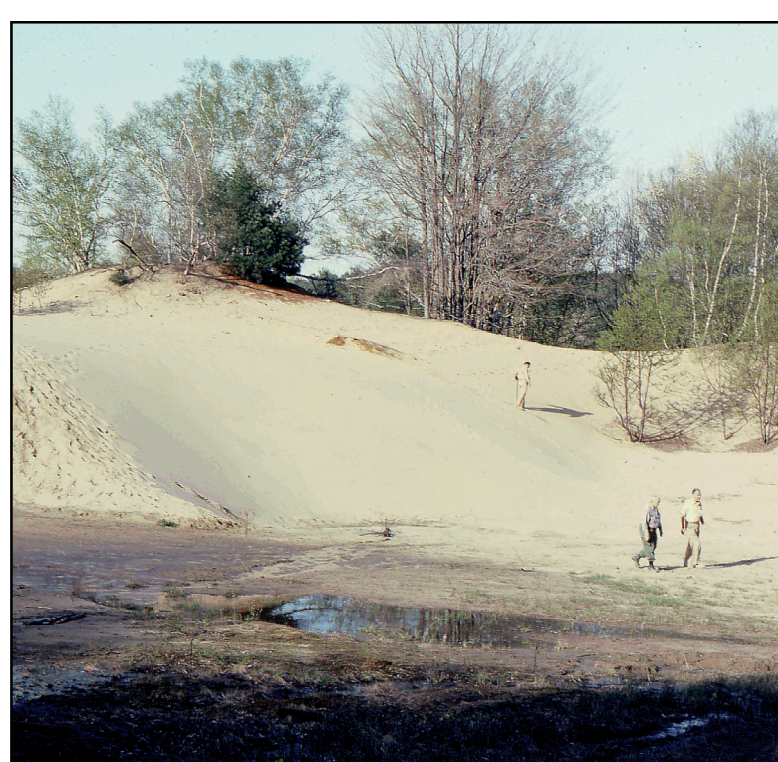
Figure 7: Sand dune in Wayne. This and other "deserts" in Maine formed as windstorms in late-glacial time blew sand out of valleys, often depositing it as dune fields on hillsides downwind. Some dunes were reactivated in historical time when grazing animals stripped the vegetation cover.