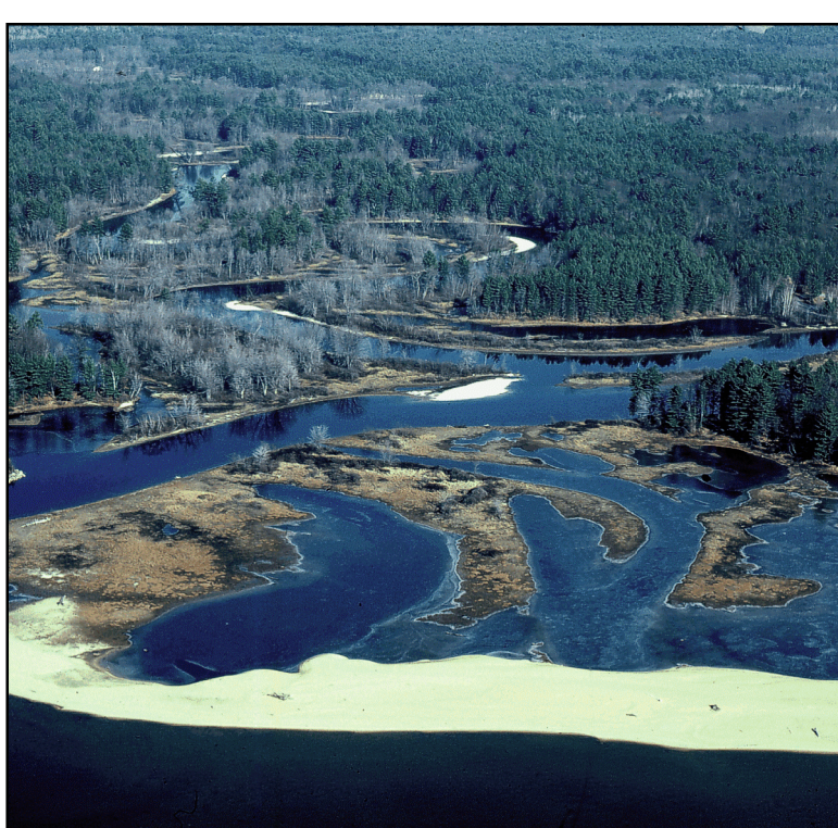
Figure 8: Songo River delta and Songo Beach, Sebago Lake State Park, Naples. These deposits are typical of geological features formed in Maine since the Ice Age.