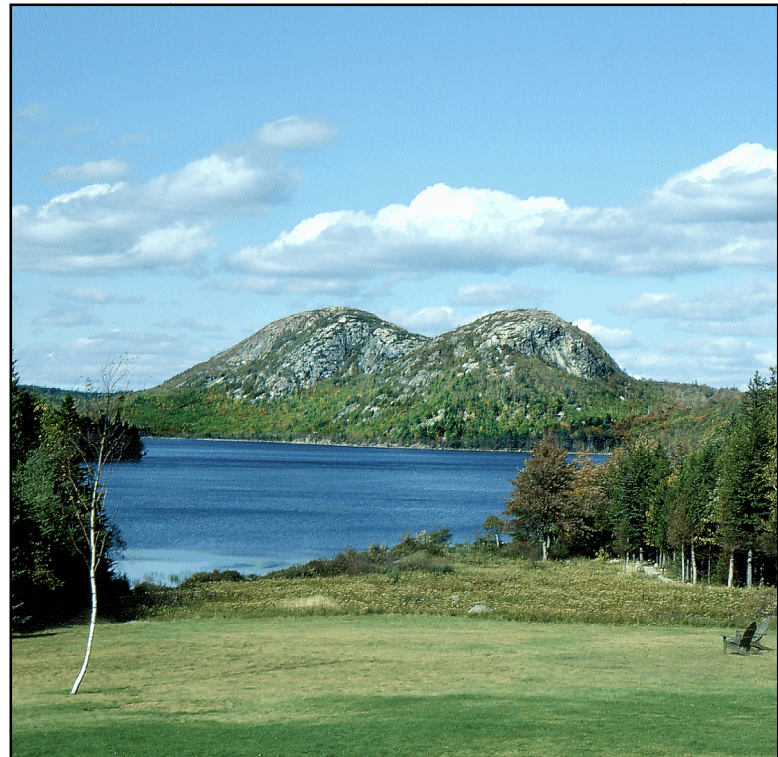
Figure 1: "The Bubbles" and Jordan Pond in Acadia National Park. These hills and valleys were sculpted by glacial erosion. The pond was dammed behind a moraine ridge during retreat of the ice sheet.