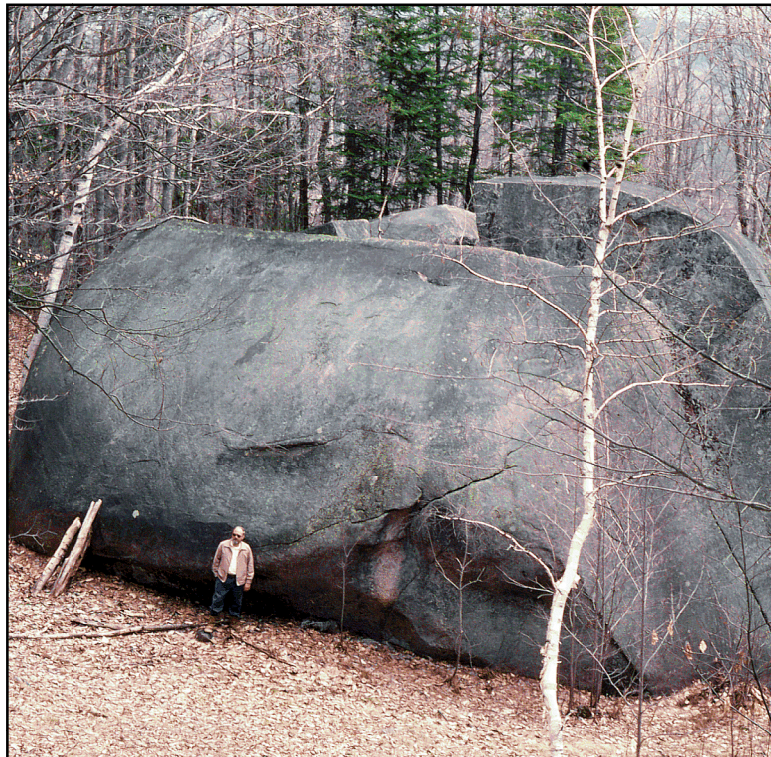
Figure 2: Dagget's Rock in Phillips. This is the largest known glacially transported boulder in Maine. It is about 100 feet long and estimated to weigh 8,000 tons.