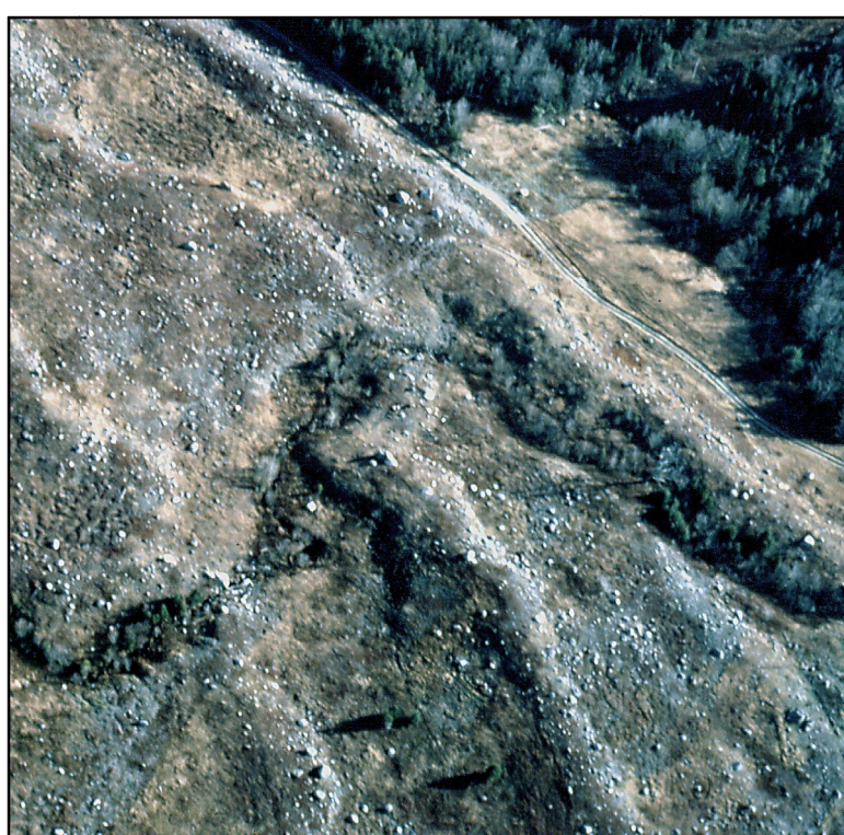
Figure 6: Aerial view of moraine ridges in blueberry field. Sedgwick (note dirt road in upper right for scale). Each bouldery ridge marks a position of the retreating glacier margin. The ice receded from right to left.