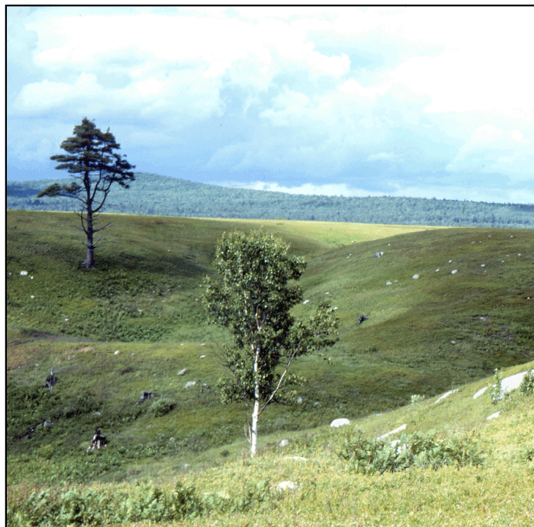
Figure 4: Glaciomarine delta in Franklin, formed by sand and gravel washing into the ocean from the glacier margin. The flat delta top marks approximate former sea level. Kettle hole in foreground was left by melting of ice.