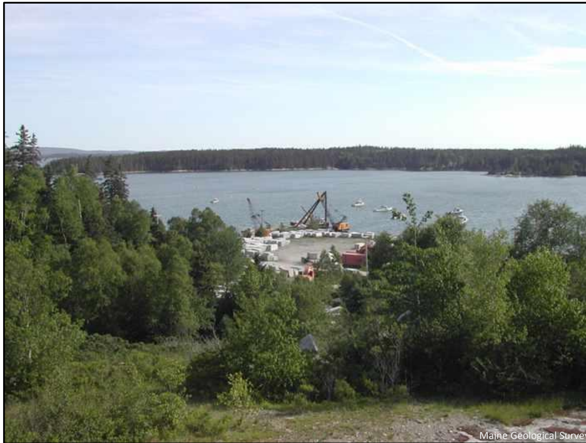
Figure 24. The pier at the foot of the Settlement Quarry has been used for over a century, and is still used today for granite stockpiling and transportation. Most of the granite is now hauled overland by truck.

The pier at the waterfront, visible from the Settlement Quarry, is still used for transportation of granite from other active quarries in the area (Figure 24).