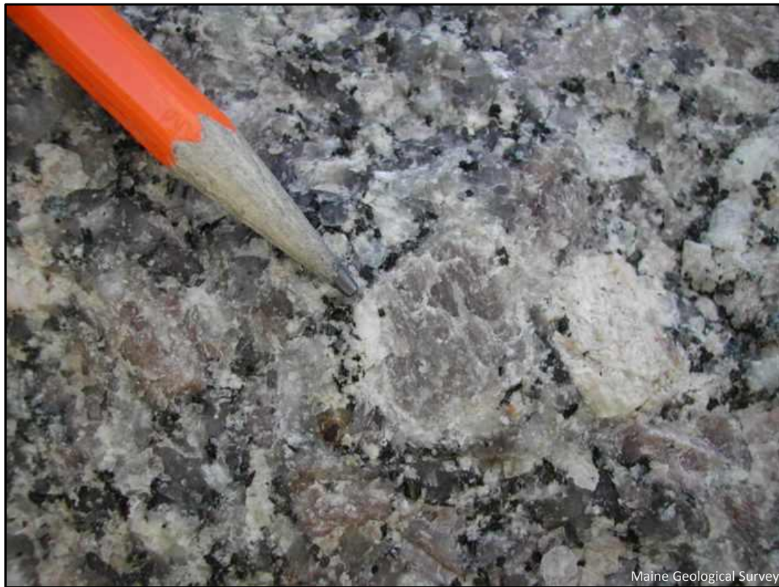
Figure 12. White feldspar occurs as thin overgrowths on pink feldspar (as indicated by the pencil point), and also as separate grains (the white grain just to the right).

White feldspar occurs both as separate grains and also as thin overgrowths on pink feldspar (Figure 12). Quartz is gray and translucent. A small amount of black mica (biotite) is sprinkled through the rock, nestled between the other minerals.