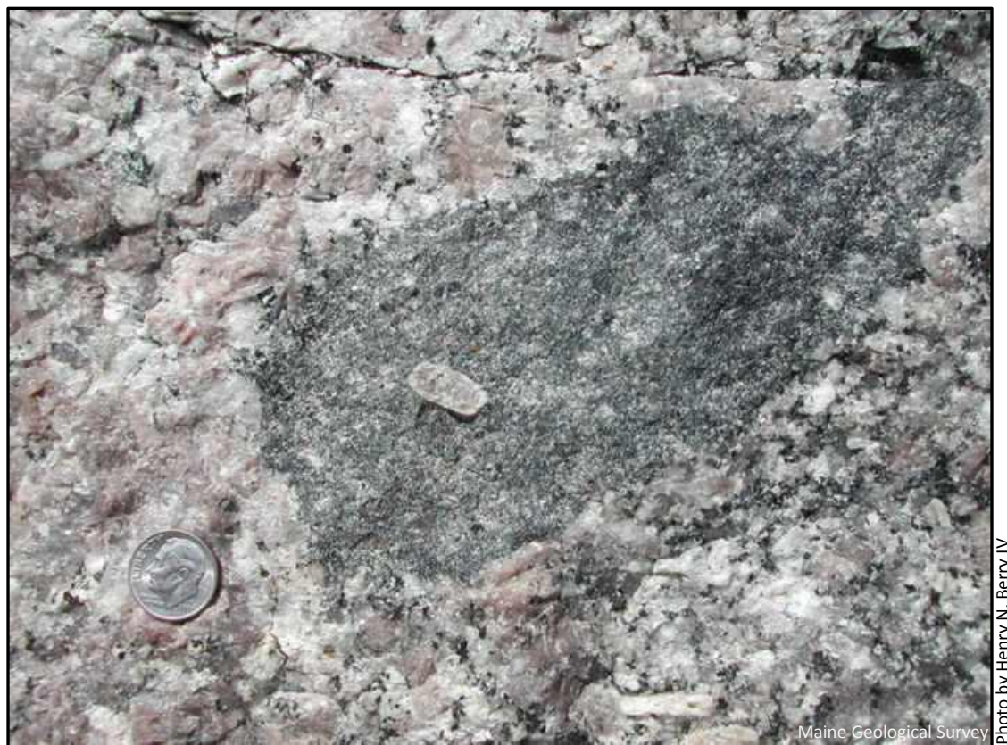
Figure 16. This enclave has a pink feldspar inside it. This indicates that enclave was still molten at the time the feldspar was mixed into it.

Compelling evidence that they were both molten at the same time is provided by the presence of feldspar grains of the granite being completely engulfed within enclaves (Figure 16). This could only happen if the enclave was not yet completely solid at the time the granite minerals had formed.