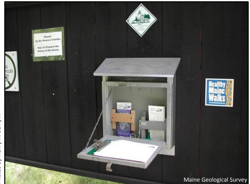
Figure 2. Dirt parking area at Settlement Quarry, Oceanville Road and the kiosk with brochures.