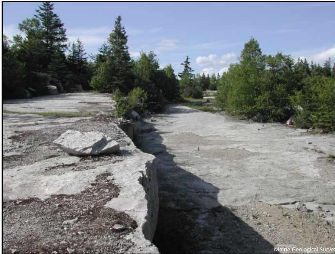
Figure 21. The step-like shape of the quarry is due to the natural spacing of horizontal sheeting joints.

The spacing of the sheeting joints determines the thickness of blocks that can be removed (Figure 21). Workers then drill sets of vertical holes a certain distance back from the quarry face, and in the direction of the rock's grain.