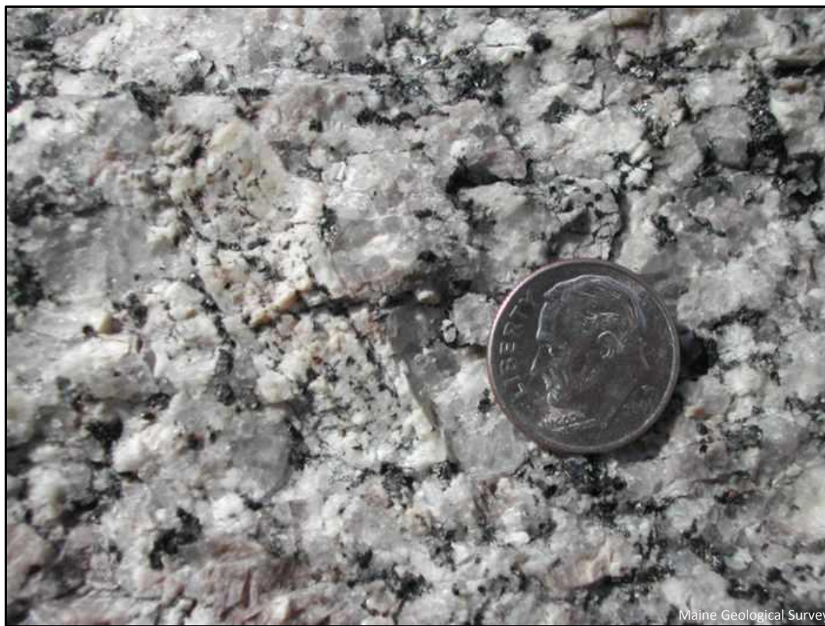
Figure 13. The long grain of white feldspar to the left of the dime has many blebs of mica and quartz inside it. This suggests a more complicated growth history than for some of the other feldspar grains.

A few of the white feldspar grains have tiny bits of biotite and quartz inside them, suggesting they had a more complicated history of formation as the molten granite was solidifying (Figure 13).