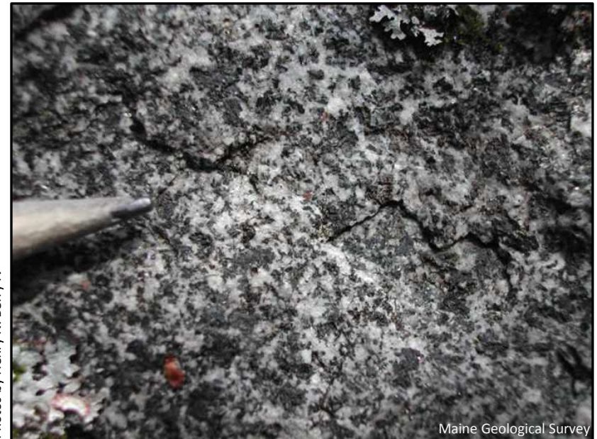
Figure 5. Rounded boulder in the Glacial Erratic Trail and a close up of the texture of the rock (hornblende diorite).