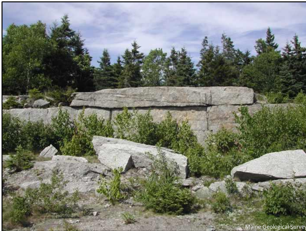
Figure 20. A natural, horizontal "sheeting" joint.

For generations, the quarrying of granite blocks was done by splitting the rock along natural fractures or planes of weakness. While modern quarrying methods may include actually cutting through solid rock with wire saws or torches, much of the stone in the Settlement Quarry was removed by drilling and blasting along natural fractures, or joints. The most important joints are the horizontal ones, which break the rock into sheets (Figure 20).