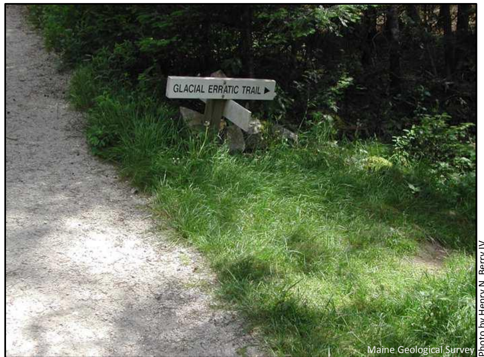
Figure 4. Beginning of the Glacial Erratic Trail.

During the last Ice Age (about 15,000 to 25,000 years ago), a continental glacier covered the whole of New England, and moved slowly across the landscape far into the Gulf of Maine. Evidence of this glacier activity is preserved at the Settlement Quarry site. The Glacial Erratic Trail (Figure 4) leads over the north slope of the hill, which is still in its natural state, unaffected by the quarrying on the south side of the hill. Most of the exposed bedrock and loose stones are made of pink granite like the rock in the quarry. A few stones, however, are not.