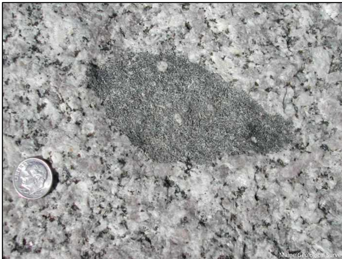
Figure 15. Another enclave, with an interesting shape.

These enclaves were called "knots" by early quarry workers, because they can cause the rock to split unevenly, much like a knot in wood. It is only recently, however, that their origin has been understood as remnants of a different magma that intruded into the granite magma when they both were still molten.