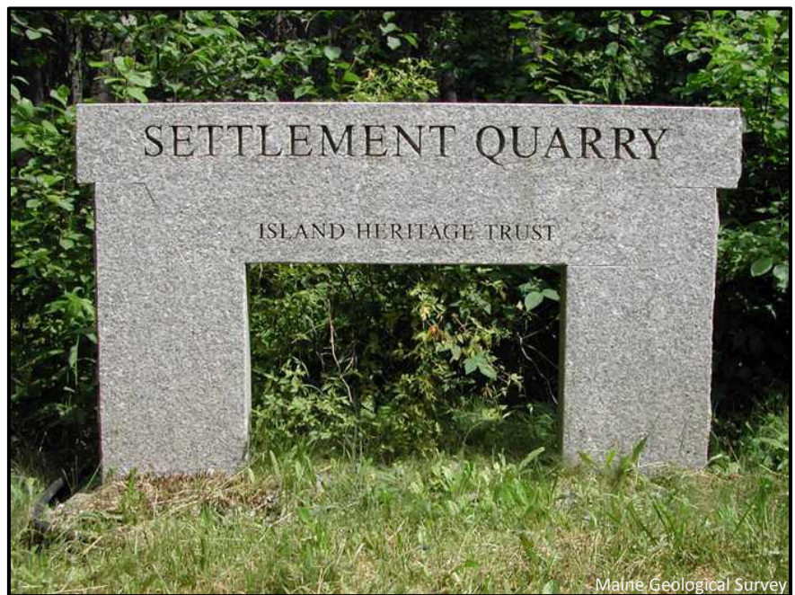
Figure 1. Entrance to Settlement Quarry.

Between Penobscot Bay and Mount Desert Island on Maine's mid-coast lies the island of Deer Isle. It can be reached by car on Maine Route 15, almost an hour south of Route 1. Most of the island, including the town of Stonington, and many of the smaller islands to the south and east are underlain by a large body of granite known as the Deer Isle pluton. Over the past two centuries, a large amount of granite has been quarried from several places in this pluton. One quarry, no longer active, is the Settlement Quarry, on Oceanville Road. In 1996, the Island Heritage Trust purchased the quarry property and has developed a network of walking trails and informational signs that make this a wonderful place to learn about the geology and history of Maine granite.