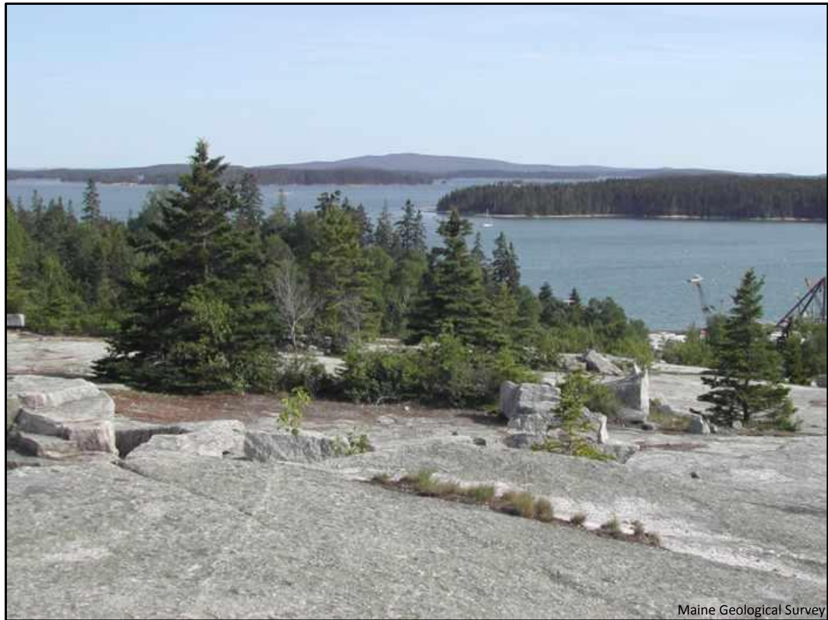
Figure 23. The grass and trees follow natural joints in the granite. Blocks that did not split evenly or straight, were left behind as unsuitable for market.

Many other blocks left at the site have irregular shapes where the rock did not split evenly (Figure 23).