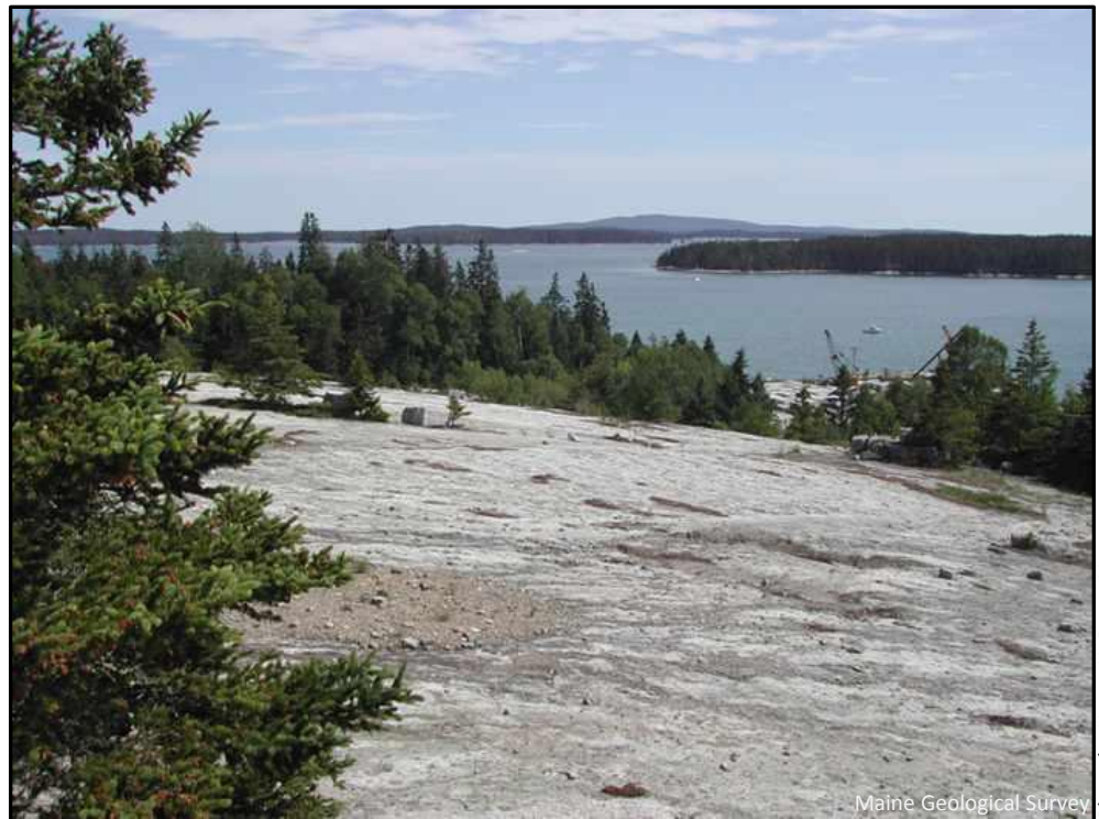
Figure 9. View toward the south from the Settlement Quarry. Isle Au Haut is on the horizon.

The excavation at the top of the hill, and which extends toward the south, mimics the original natural shape of the hill. The blocks of rock were removed primarily in layers, which has left broad flat areas separated by vertical steps. Proximity to the ocean was important in allowing the large, heavy blocks to be shipped to market. For us, this combination of broad, open quarry near the ocean makes for splendid views of Webb Cove in the foreground, and Isle Au Haut on the horizon (Figure 9). It also provides many large, smooth surfaces for looking closely at the rock.