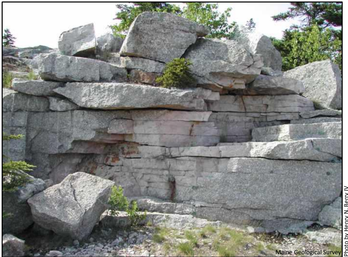
Figure 19. A wide aplite dike cuts through granite from lower left to upper right. The aplite is much more intensely fractured than the granite, making the rock unsuitable for quarrying large blocks.

Some aplites, especially the larger ones, can affect the quarrying, not only because the rock looks different from the granite, but also because the aplites can be more strongly fractured and difficult to work (Figure 19).