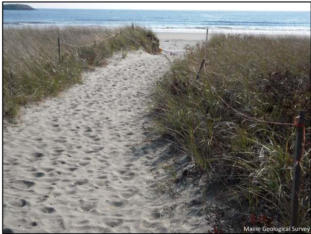
Figure 5. The path turns from gravel and asphalt to soft sand at the entrance to the beach. From the high point shown in the path it is possible to see the large frontal dune system of Seawall beach.

At the end of the main trail, the path crosses through mature back dunes and the frontal dune (Figure 5). Seawall Beach is one of Maine's finest beaches. The beach is important habitat for piping plovers and least terns and signs at the entrance to the beach will inform visitors of what they look like and how to avoid disturbing them in nesting season in the summer.