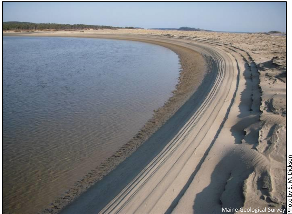
Figure 10. A view of the south bank of the Morse River where the Seawall Beach dunes end.

The Morse River separates Seawall Beach from Popham Beach. In November 2008 the channel was located along its usual course next to a bedrock outcrop behind Seawall Beach. As it made its way to sea the river took a sharp bend to the east and flowed toward Popham Beach (Figure 10). Be cautious on the bank of the river. Sand can be soft and it is possible to slip off the bank and into the river. The Morse River flows out to sea during the ebbing (falling) tide and into the salt marsh on a flooding (rising) tide. At the mid-tide level (either ebb or flood) the currents will be the strongest and the most dangerous.