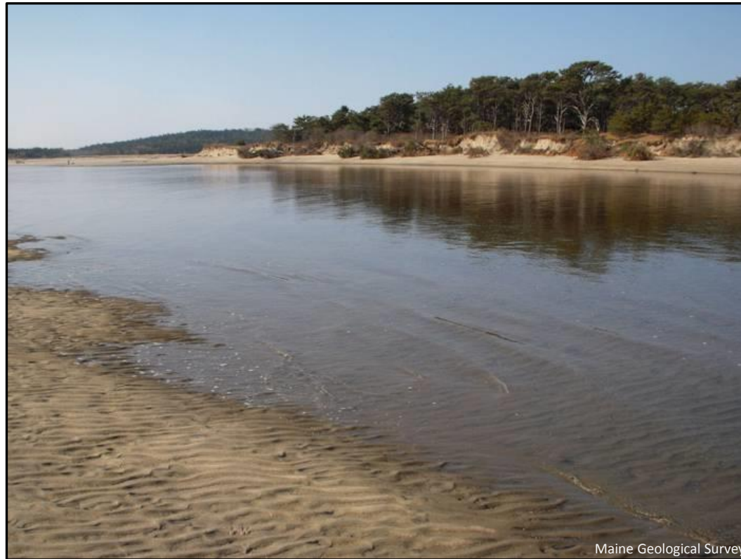
Figure 17. A view from the Seawall Beach spit across the Morse River to the west beach at Popham Beach State Park. Fallen trees and high dune scarps are common along most of this stretch of the park's shoreline.

From the spit it is possible to look across the Morse River and see the loss of dunes caused by the undercutting by the river. As described in March 2008 ( Dickson, 2008 ) the channel has scoured sand and led to shoreline migration into dunes that have existed for more than 50 years (Figure 17).