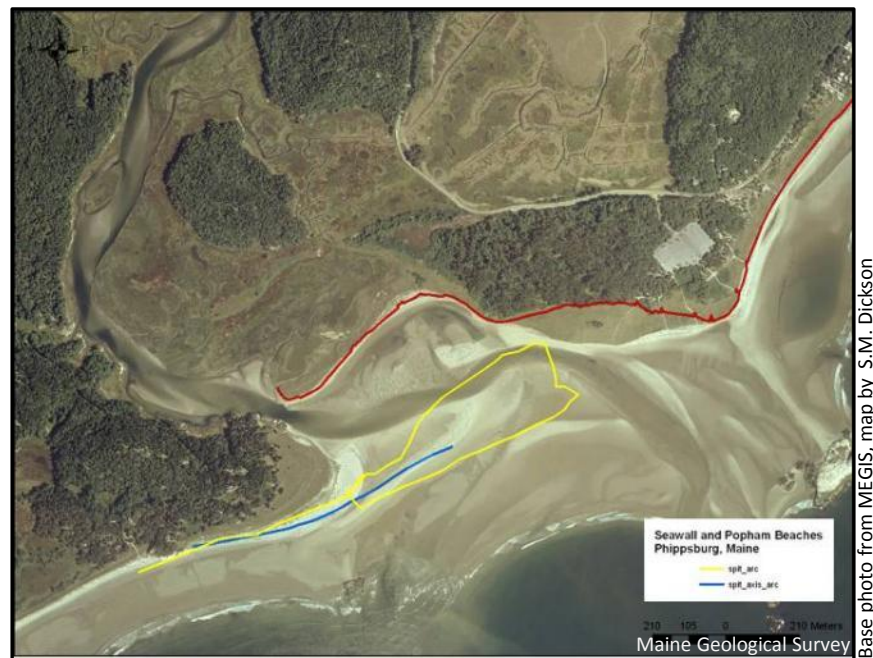
Figure 21. Map of the Seawall Beach, Morse River, and Popham Beach in Phippsburg, Maine. The base air photo is from August 23, 2005, courtesy of the Maine Office of GIS and Seth Barker of the Maine Department of Marine Resources.

Figure 21 is a map of the Seawall and Popham Beaches. The yellow line marks the November 2008 position of the last high tide swash line (elevation approximately 8 feet above mean lower low water) and serves as a contour to outline the spit as well as the berm edge along Seawall Beach. The blue line approximates the highest elevations on the beach spit where they could be mapped in November 4, 2008. The spit becomes very flat on the eastern end so a ridge could not be mapped. The red line is a June 7, 2007 shoreline survey along the seaward edge of the dune at Popham Beach State Park conducted by MGS.