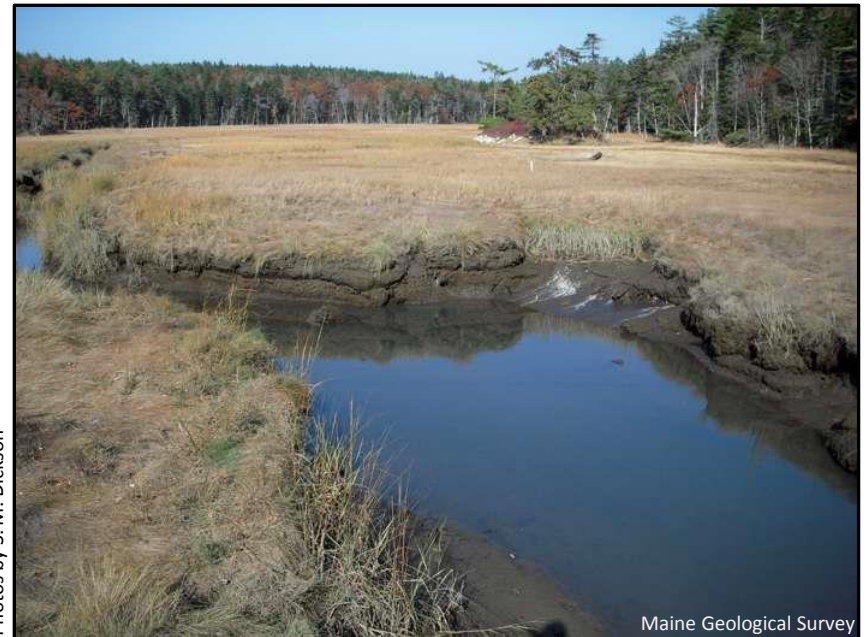
Figure 3. (Left) The path crosses the Sprague River and salt marsh. A culvert allows tidal currents to flow beneath the path. This is an area where Bates College, The Nature Conservancy, the Small Point Association, The Natural Resources Conservation service and others began a salt marsh restoration effort in 2002. (Right) A view of Sprague River channel.