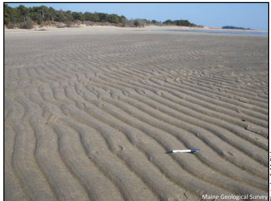
Figure 12. Linear-crested sand ripples shown in this photo are slightly asymmetrical. The steeper side faces the direction of net sand transport.

As you walk farther out on the spit (tide permitting) you will see a general lowering of the sand elevation and a variety of sand ripples on the surface (Figure 12-15). The eastern end of the spit has lower elevations and is overtopped by more of the tidal cycle (Figure 12). Across much of the spit at the eastern end, net sand transport is in a shoreward direction across the top of the spit. Close examination often shows that the crests of the ripples have a reversed asymmetry indicating seaward transport on the last phase of the ebbing current across the spit, just prior to their exposure in the air. In places the ripples appear "flat topped" due to flow reversal on a falling tide.