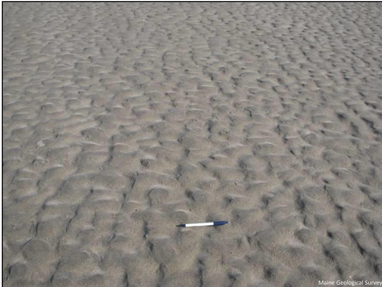
Figure 14. Three-dimensional ripples have sinuous crests and a more hummocky shape than linear ripples. These ripples can indicate faster currents than those that formed the linear ripples.