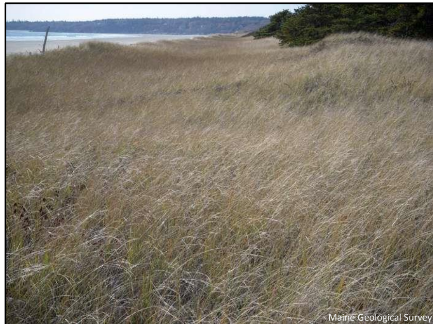
Figure 6. The frontal dune ridge at Seawall Beach. The rise in the dune ridge to the right side of the photo is a relict dune scarp from the Blizzard of February 1978. The storm created coastal flooding, and large surf eroded the dune well inland of where it is today. This 100-year storm left a legacy in many of Maine's frontal dunes similar to that seen here.

It is very linear and has a natural frontal dune ridge (Figure 6) and no seawalls as the name might suggest. Winter erosion can lead to dune loss and the formation of a vertical drop or scarp that runs along the frontal dune. As you approach the beach on the dune path look to the right (southwest) and note the change in dune elevations that are vegetated with American beachgrass . See if you can see signs of fresh sand washed into the dune from recent ocean storms. This process, called overwash, leads to the dunes building in elevation and being more storm resistant.