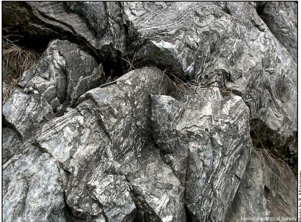
Figure 7. Several fold hinges plunge gently to the northeast.

The hinge lines of the folds plunge gently to the northeast (Figure 7). From all the information on the tilting of beds, the style and distribution of folds, and the orientation of their hinges, the geologist can draw a geologic map of the quarry (Figure 8).