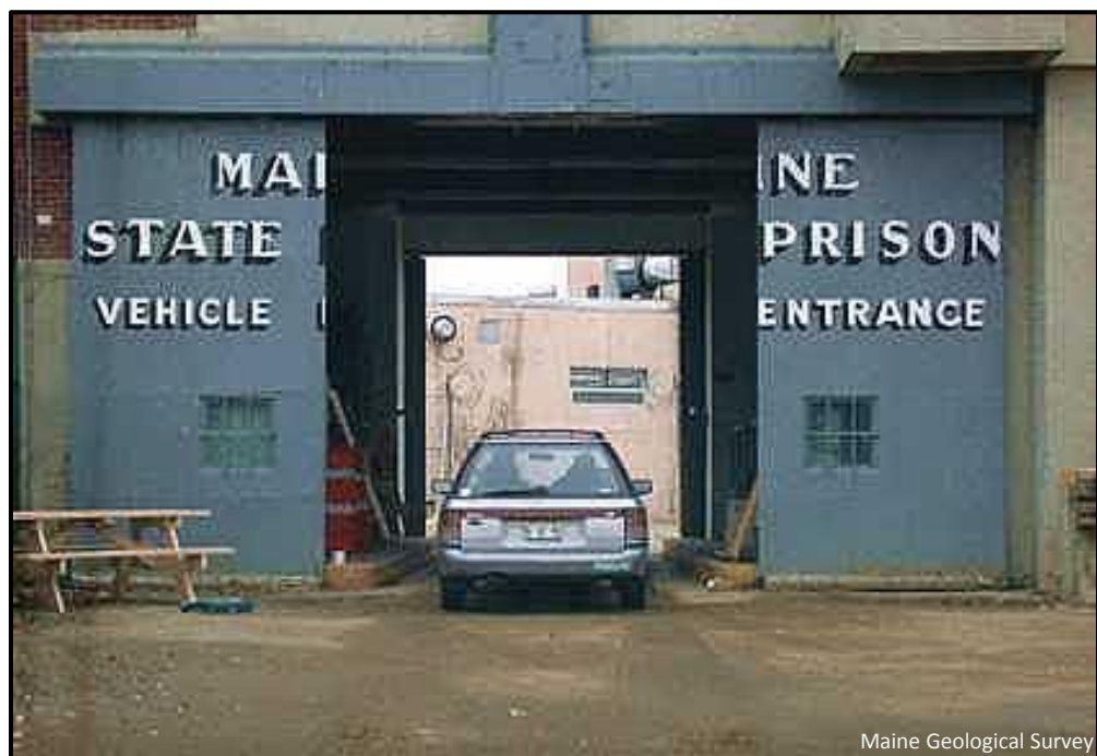
Figure 1. The main vehicle entrance to the Maine State Prison.

On February 14, 2002, an era in Maine prison history closed when the last inmate at the State Prison at Thomaston was transferred to the new facility in Warren. For a few brief days following, the public was invited to view the "dark and comfortless abode of guilt and wretchedness" that the Legislature approved for construction in 1823 and that will soon be torn down to make way for a park (Figure 1). For those of you unfortunate enough to have spent time at the quarry while it was in use, this site will serve as a reminder of those days. For the rest of us who are fortunate to have never spent any time at the prison, this site will provide a vignette of some remarkable geology that will henceforth remain hidden.