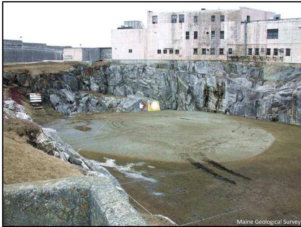
Figure 2. Overview of the marble quarry.

Part of the prison facility on what was known as "Limestone Hill" includes a small marble quarry that was originally used for hard labor by the inmates. When in 1923 the original prison burned, the rubble was pushed into the bottom of the quarry, covered over and flattened to make an outdoor recreational area that most recently hosted the prison's baseball diamond (Figure 2). A stratigraphy thus begun will be continued as rubble from the razed prison will yet again be pushed into the hole.