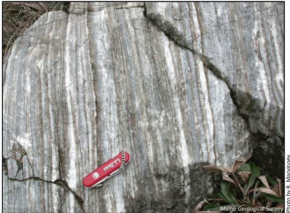
Figure 4. An example of thinly bedded marble typical of the prison quarry. Bedding is generally less than an inch thick to several inches.

Well exposed in the sides and southwest end of the quarry are beds of marble, originally deposited as horizontal layers, but now tilting steeply to the northwest. The marble is composed of thin beds generally an inch to several inches in thickness (Figure 4). Most beds are light gray in color, but this color is quite variable from bed to bed due to variations in the amount of graphite in each. The graphite came from organisms, presumably algae, that lived in the Precambrian sea. No fossils have been discovered in these rocks.