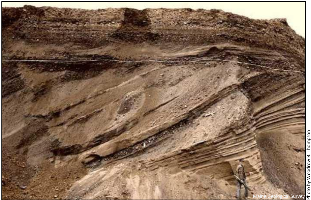
Figure 3. Photograph of excavated exposure in a gravel pit in a delta in Whitefield, Maine. The person in the lower right hand corner of the photo is standing adjacent to the foreset beds of the delta.

A photo of a vertical cut in a delta in Whitefield, Maine (Figure 3), shows the stream deposits (topset beds) overlying the dipping foreset beds. The same type of sedimentary structure in the Jailhouse delta is represented in the GPR image, confirming the interpretation from surficial mapping.