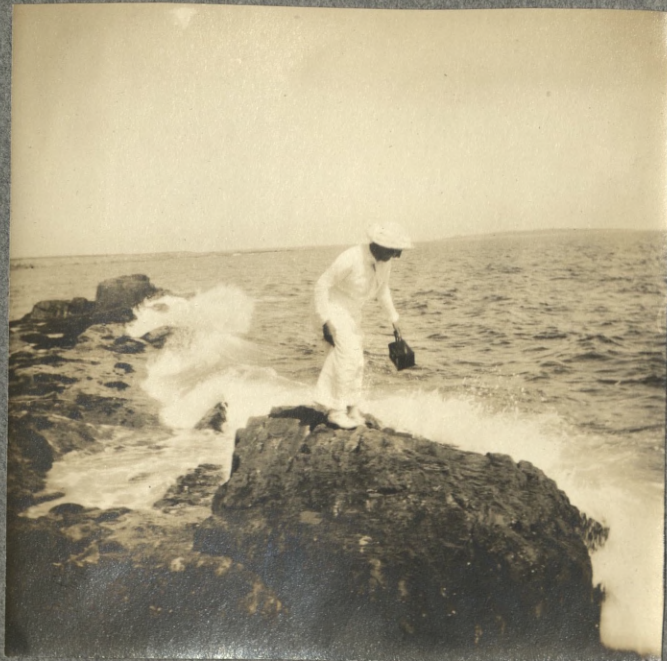
Mrs. East nearly caught by the surf Orantery island.