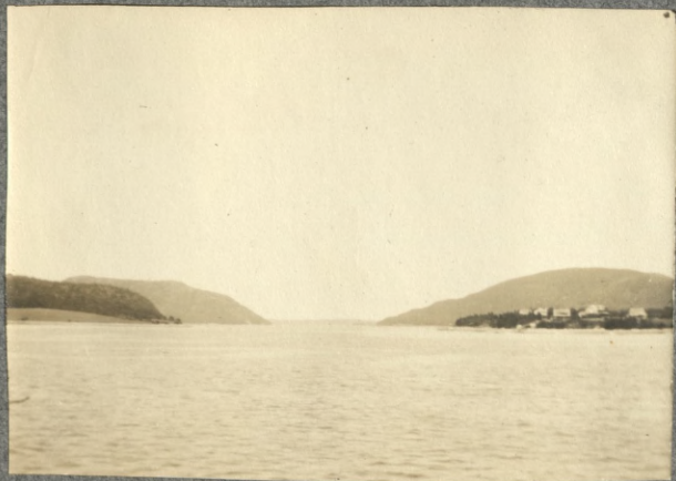
Mt. Desert, Maine.