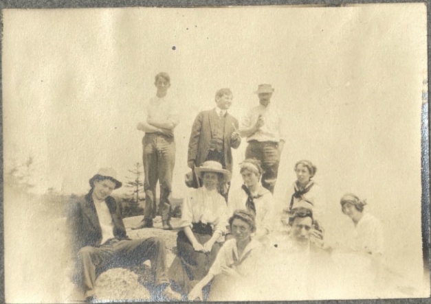
The Sketching Party.