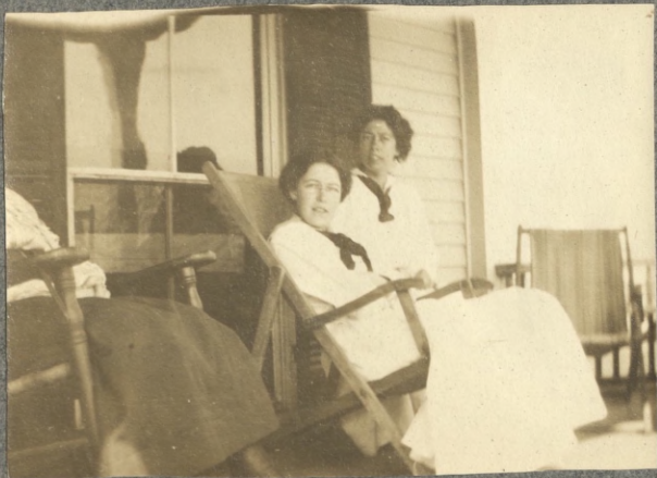
The Richards Cottage Ventnor