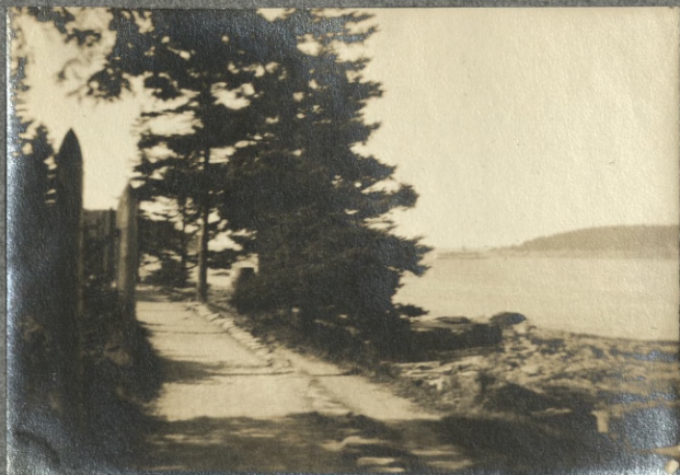
Over the drive - near Bar Harbor Maine.