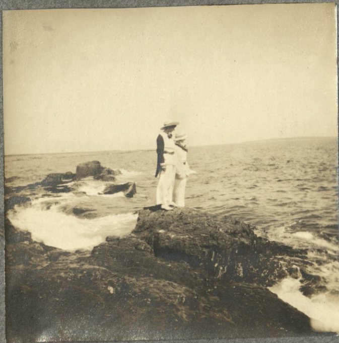
Isabel and Betty.