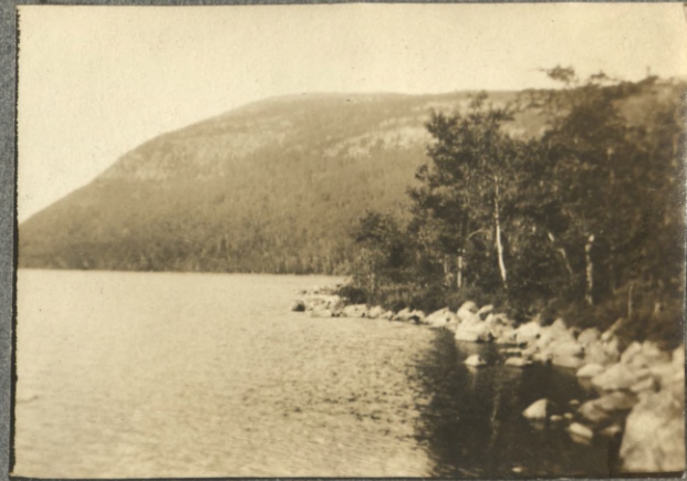
As every day sight on Mt. Desert, Maine