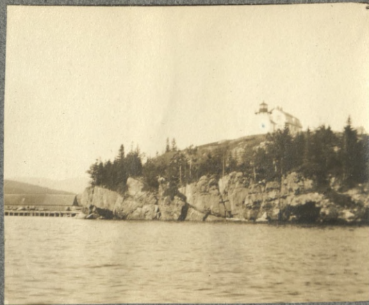
Bear Island light house