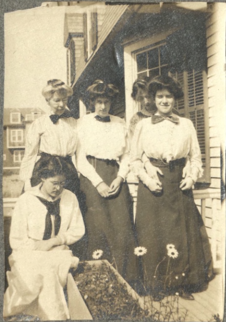
The House Party Ventnor