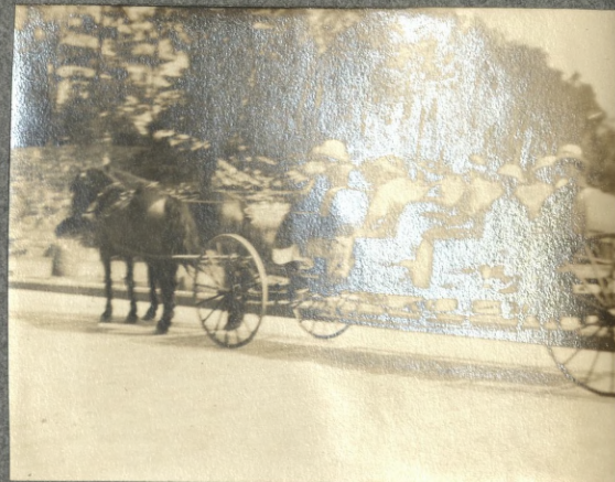
Our drive from Deal Harbor to Bear Harbor