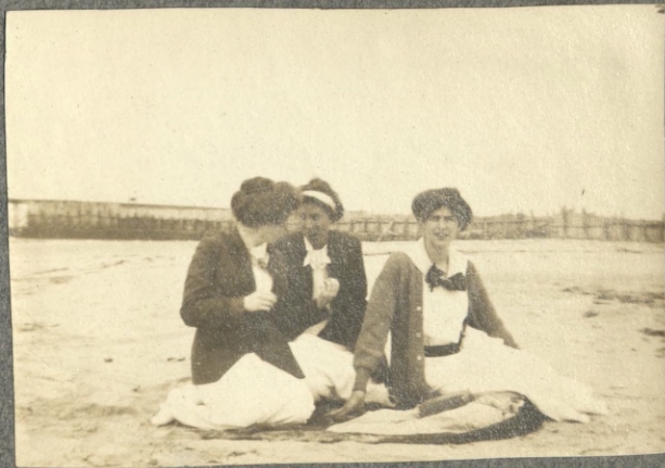
On the Beach Ventnor.