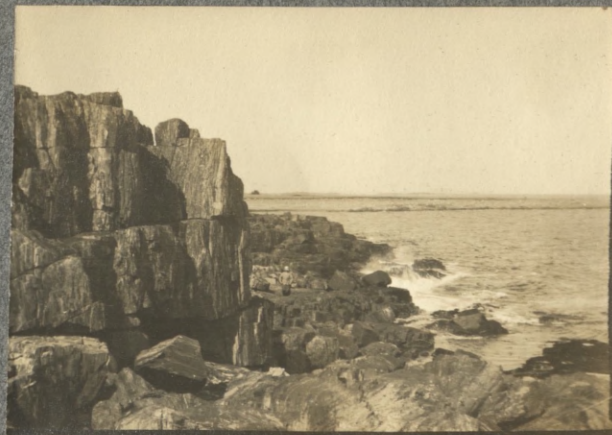
Cranberry Island Maine.