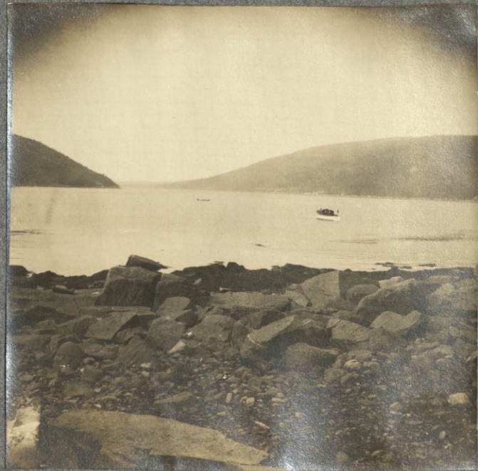
The motor we often rock in.