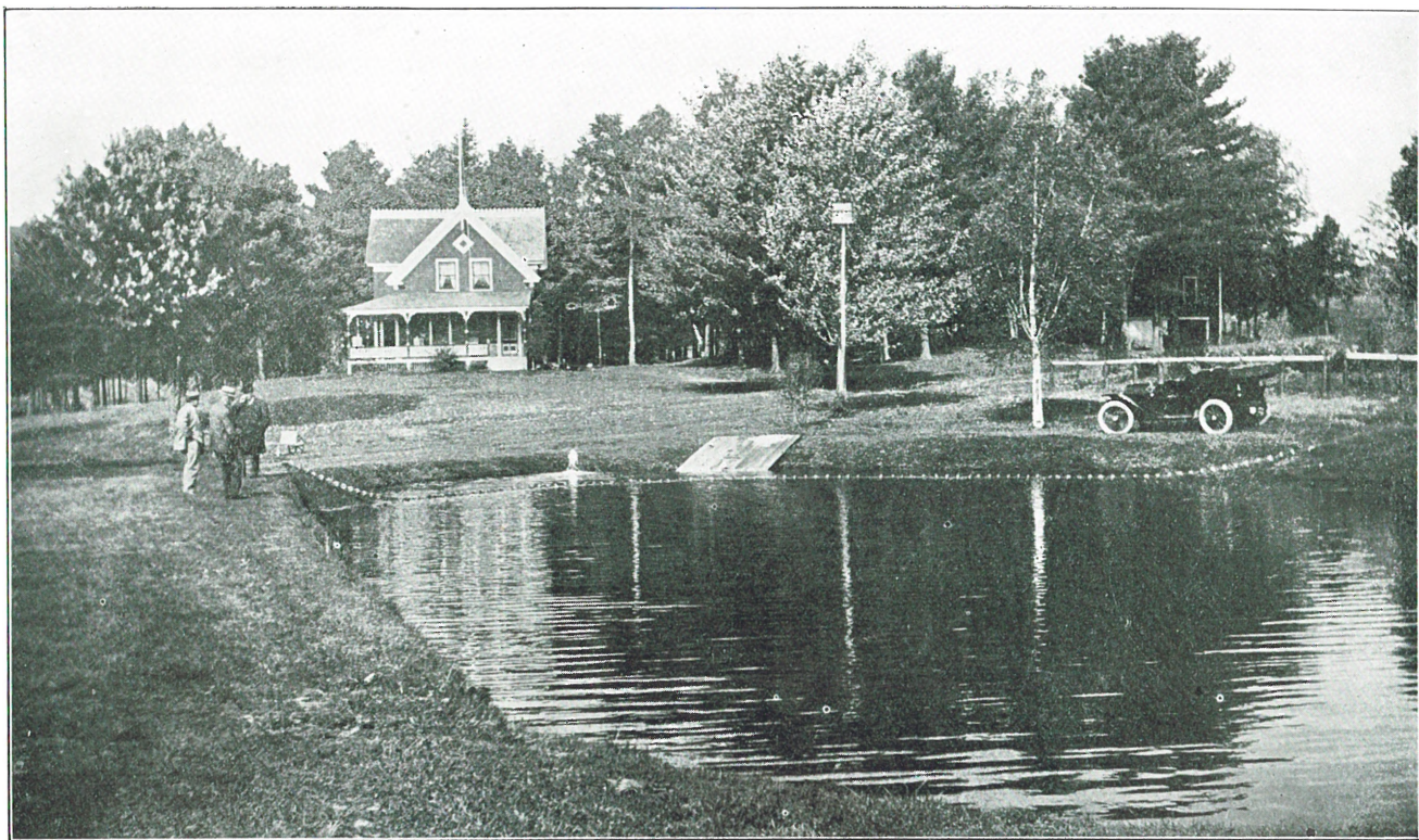
STATE FISH HATCHERY, EAST AUBURN, MAINE.