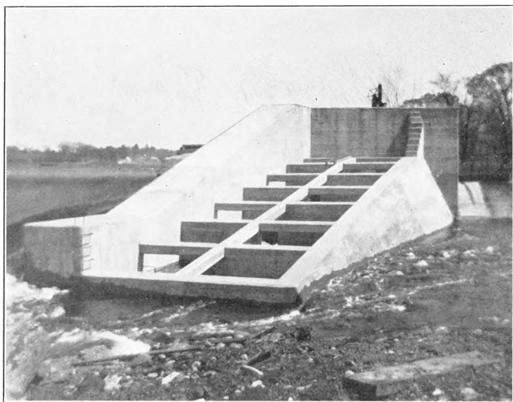
BANGOR FISHWAY AT HIGH TIDE