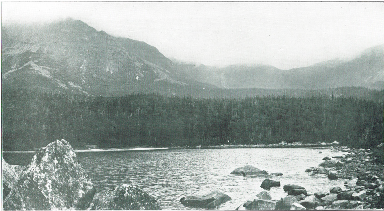
Approach to Katahdin by Chimney Pond, whose Pure Waters Lave the Shore More Than 3000 Feet Above Sea Level, an Awe Inspiring Spot and Delightful Tarry- ing Place on the Appalachian Trail Before Completing the Climb to the Top Which Pierces the Clouds 2000 Feet Above