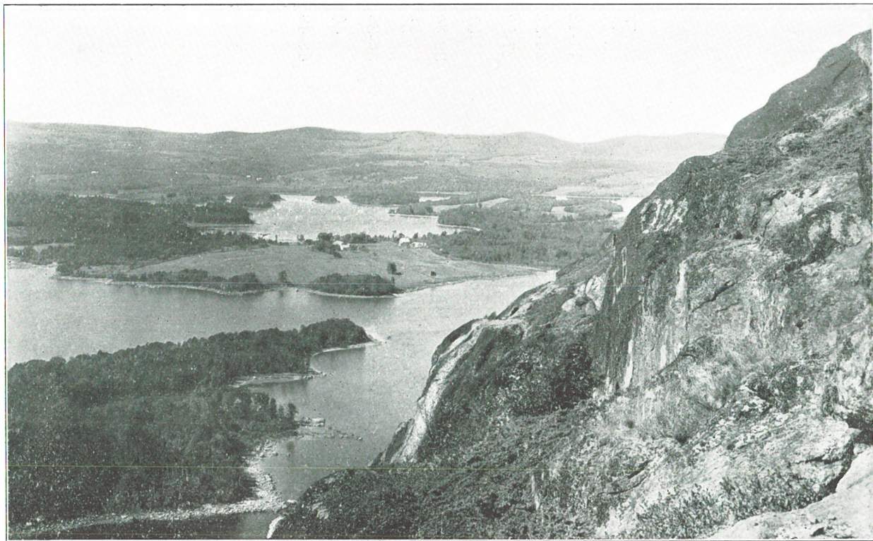
A GLIMPSE OF LAKE MEGUNTICOOK, NEAR CAMDEN, MAINE.