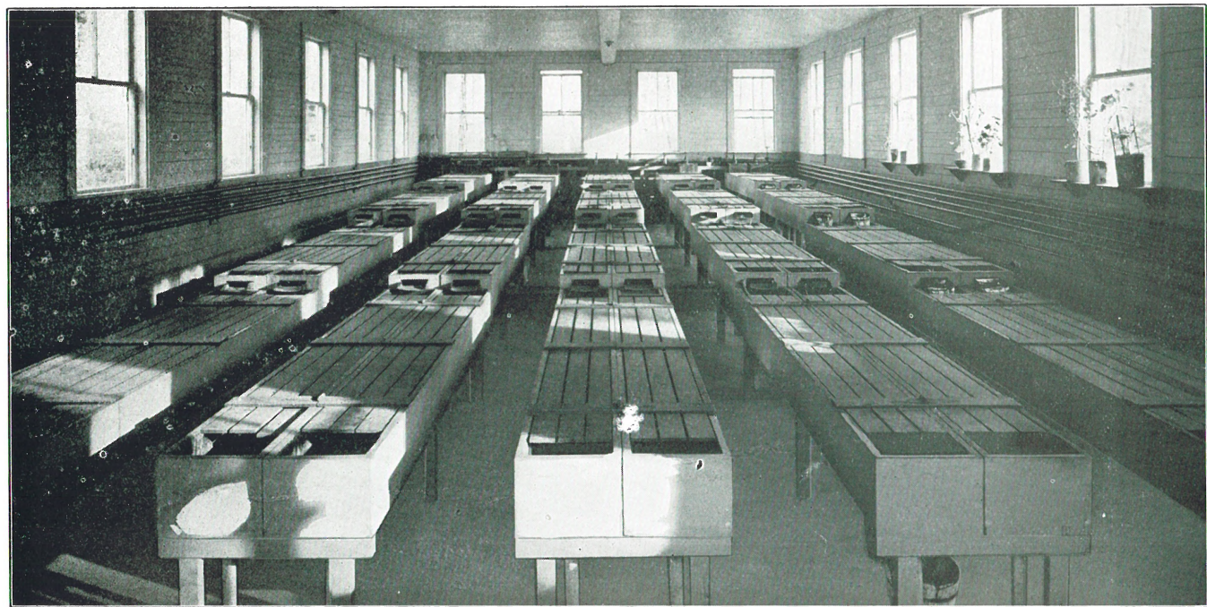
INTERIOR OF A MAINE STATE FISH HATCHERY.