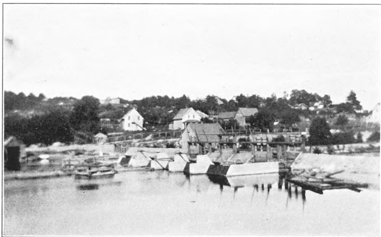
FISH SCREEN AT GRAND LAKE STREAM, WASHINGTON COUNTY