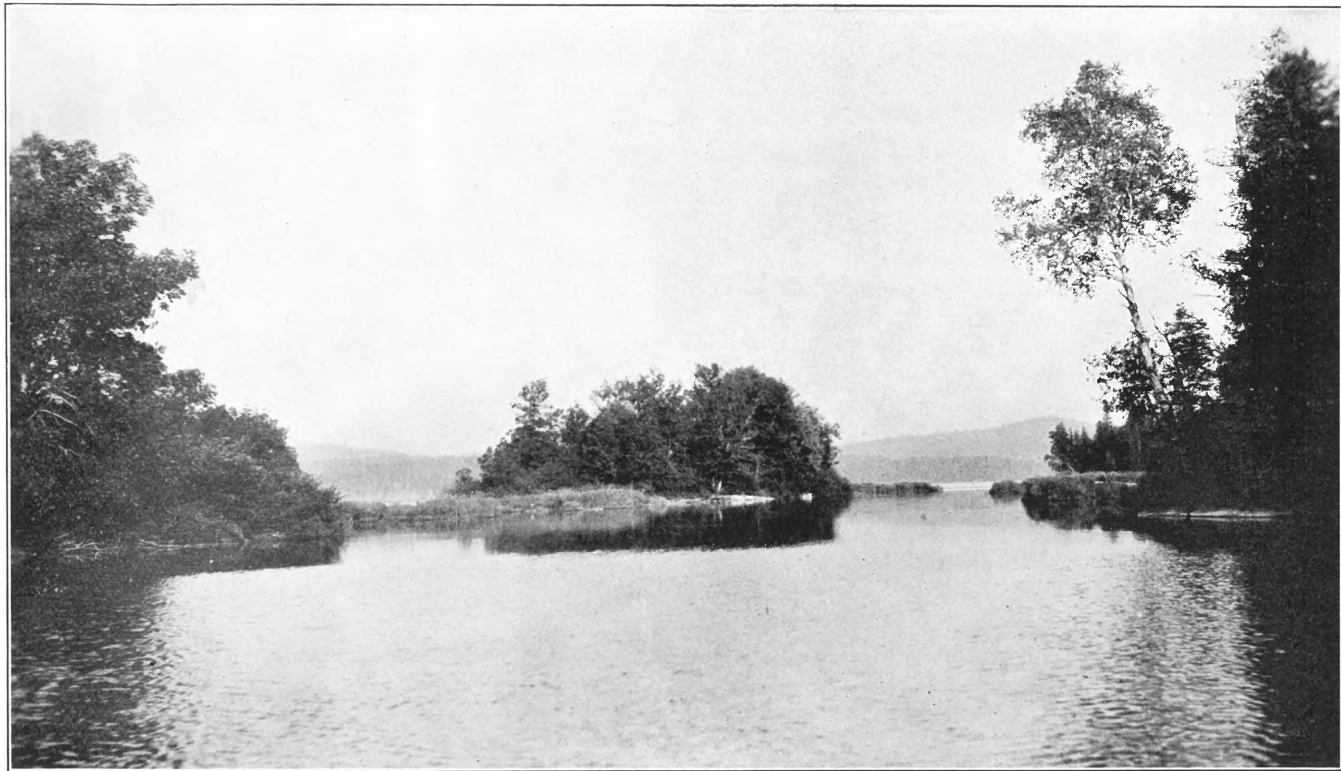
ENTRANCE INTO ROUND POND, ON THE ALLAGASH.