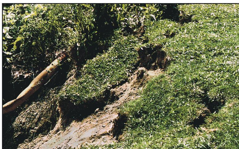
Figure 4. Downslope forces within a bluff cause surface layers to stretch. When the tension becomes great enough, a crack forms and the pressure is released. These "tension cracks" may form on the top edge of the bluff or on the bluff slope itself. They indicate instability and motion within the bluff. Some cracks are deep and extend below the soil layer.