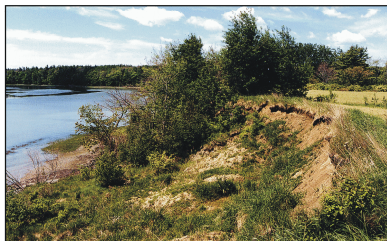
Figure 5. Terraces on a hummocky land surface on the slope of a bluff can indicate a former landslide. Terraces on the bluff face contribute to surface water flow and destabilize the bluff face. In addition, a high water table can saturate and weaken muddy sediment and make the ground more prone to slope failure.