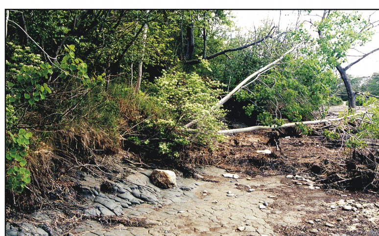
Figure 7. Wave erosion at the base of a bluff removes slope sediment and steepens the bluff. Erosion has undercut the trees in the photo above and caused them to tilt toward the ocean. This steepening reduces the stability of the bluff, and a landslide may result. Ongoing sea-level rise along the Maine coast will cause wave erosion at the base of coastal bluffs and continue to make some coastal bluffs at risk of experiencing a landslide.