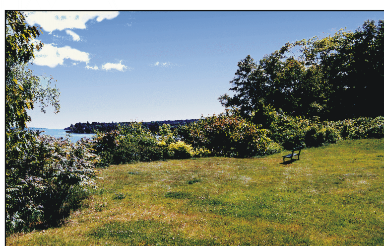
Figure 3. The shape of the top edge of a bluff can be an indicator of landslide risk. Clay bluffs often fail at points of weakness. Such a "slump" can expand into a larger landslide that cuts into the bluff and forms a curve around the original point of failure. Multiple slides and slumps will form an irregular or arcuate top edge to the bluff as shown in the photo above. Bluffs made of coarse materials or sand have a more even upper edge caused by a more constant rate of erosion along the bluff face.