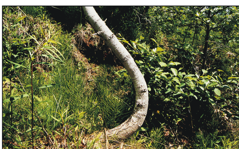
Figure 6. Soil "creep" or downslope movement of soil on a slope, will cause tree trunks to tilt toward the base of the slope. As a moving tree continues to grow, the trunk will curve as the tree trunks are forced to grow toward the sun. Landslides will also cause tree trunks to become curved.