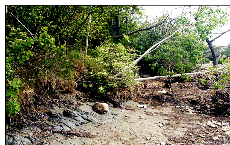
Figure 7. Wave erosion at the base of a bluff removes slope sediment and steepens the bluff. Erosion has undercut the trees in the photo above and caused them to tilt toward the ocean. This steepening reduces the stability of the bluff, and a landslide may result. Ongoing sea-level rise along the Maine coast will cause wave erosion at the base of coastal bluffs and continue to make some coastal bluffs at risk of experiencing a landslide.