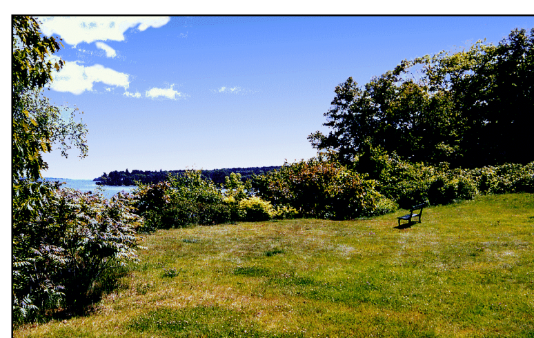
Figure 3. The shape of the top edge of a bluff can be an indicator of landslide risk. Clay bluffs often fail at points of weakness. Such a "slump" can expand into a larger landslide that cuts into the bluff and forms a curve around the original point of failure. Multiple slides and slumps will form an irregular or arcuate top edge of the bluff as shown in the photo above. Bluffs made of coarse materials or sand have a more even upper edge caused by a more constant rate of erosion along the bluff face.