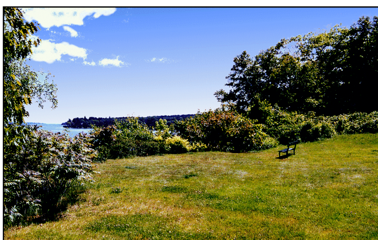
Figure 3. The shape of the top edge of a bluff can be an indicator of landslide risk. Clay bluffs often fail at points of weakness. Such a "slump" can expand into a larger landslide that cuts into the bluff and forms a curve around the original point of failure. Multiple slides and slumps will form an irregular or arcuate top edge to the bluff as shown in the photo above. Bluffs made of coarse materials or sand have a more even upper edge caused by a more constant rate of erosion along the bluff face.