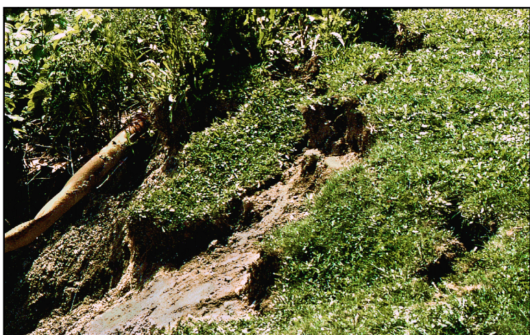
Figure 4. Downslope forces within a bluff cause surface layers to stretch. When the tension becomes great enough, a crack forms and the pressure is released. These "tension cracks" may form on the top edge of the bluff or on the bluff slope itself. They indicate instability and motion within the bluff. Some cracks are deep and extend below the soil layer.