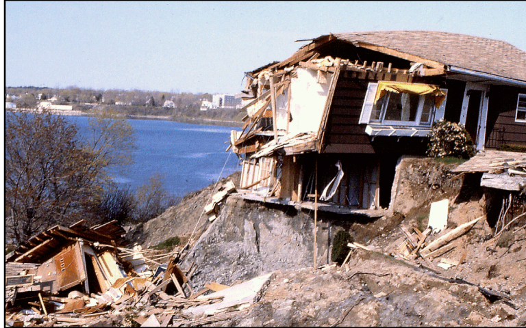
Figure 1. A clay bluff on the north shore of Rockland Harbor failed in 1996. This landslide formed a new scarp about 200 feet landward of the original top of the bluff in just a few hours. Two homes were destroyed as a result of this catastrophic slide (see Berry and others, 1996).

Sea level is gradually rising along the coast of Maine (Kelley and others, 1996). This rise in the ocean allows waves to erode beaches and flats at the base of coastal bluffs (see Figure 2A). Over time, erosion removes material from the base of a coastal bluff and steepens the face of the bluff (Figure 2B). Sediments at the base of the bluff stabilize it, and when they are removed, the bluff is no longer in equilibrium. Only the strength of the material within the bluff holds the bluff in place. Continued erosion or lubrication of the bluff materials by ground water may overcome this internal resistance, particularly in clay bluffs, and result in a landslide (Figure 2C). A landslide restores the equilibrium of the bluff, and the slumped materials at the foot of the bluff support a new bluff face with a gentler profile (Figure 2D). Erosion, however, is a continuing process because the level of the sea is rising, and coastal waves and currents immediately begin to remove the edges of the displaced sediment. Eventually, erosion destroys the equilibrium of the bluff and leads to another landslide, repeating the cycle shown at right.