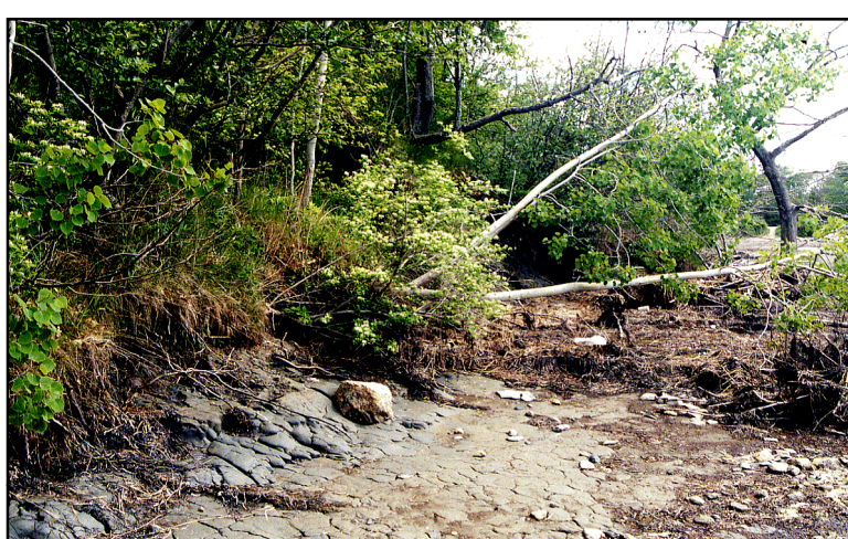
Figure 7. Wave erosion at the base of a bluff removes slope sediment and steepens the bluff. Erosion has undercut the trees in the photo above and caused them to tilt toward the ocean. This steepening reduces the stability of the bluff, and a landslide may occur. Ongoing sea-level rise along the Maine coast will cause wave erosion at the base of coastal bluffs and continue to make some coastal bluffs at risk of experiencing a landslide.