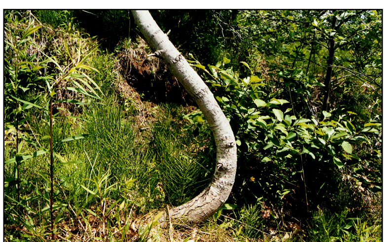
Figure 5. Wave erosion at the base of a bluff removes slope sediment and steepens the bluff. Erosion has undercut the trees in the photo above and caused them to tilt toward the ocean. This steepening reduces the stability of the bluff, and a landslide may result. Ongoing sea-level rise along the Maine coast will cause wave erosion at the base of coastal bluffs and continue to make some coastal bluffs at risk of experiencing a landslide.