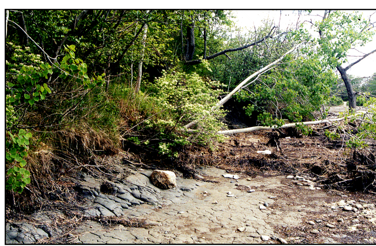
Figure 6. Soil "creep," or downslope movement of soil on a slope, will cause tree trunks to tilt toward the base of the slope. As a moving tree continues to grow, the trunk will curve as the tree tries to right itself and grow toward the sun. Landslides will also cause tree trunks to become curved.