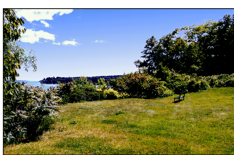
Figure 3. The shape of the top edge of a bluff can be an indicator of landslide risk. Clay bluffs often fail at points of weakness. Such a "slump" can expand into a larger landslide that cuts into the bluff and forms a curve around the original point of failure. Multiple slides and slumps will form an irregular or arcuate top edge to the bluff as shown in the photo above. Bluffs made of coarse materials or sand have a more even upper edge caused by a more constant rate of erosion along the bluff face.