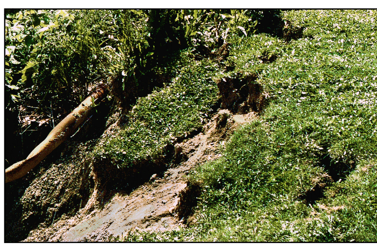
Figure 4. Downslope forces within a bluff cause surface layers to stretch. When the tension becomes great enough, a crack forms and the pressure is released. These "tension cracks" may form on the top edge of the bluff or on the bluff slope itself. They indicate instability and motion within the bluff. Some cracks are deep and extend below the soil layer.