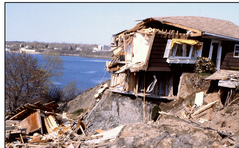
Figure 1. A clay bluff on the north shore of Rockland Harbor failed in 1996. This landslide formed a new scarp about 200 feet landward of the original top of the bluff in just a few hours. Two homes were destroyed as a result of this catastrophic slide (see Berry and others, 1996).

Sea level is gradually rising along the coast of Maine (Kelley and others, 1996). This rise in the ocean allows waves to erode beaches and flats at the base of coastal bluffs (see Figure 2A). Over time, erosion removes material from the base of a coastal bluff and steepens the face of the bluff (Figure 2B). Sediments at the base of the bluff stabilize it, and when they are removed, the bluff is no longer in equilibrium. Only the strength of the material within the bluff holds the bluff in place. Continued erosion or lubrication of the bluff materials by ground water may overcome this internal resistance, particularly in clay bluffs, and result in a landslide (Figure 2C). A landslide restores the equilibrium of the bluff, and the slumped materials support a new bluff face with a gentler profile (Figure 2D). Erosion, however, is a continuing process because the level of the sea is rising, and coastal waves and currents immediately begin to remove the edges of the displaced sediment. Eventually, erosion destroys the equilibrium of the bluff and leads to another landslide, repeating the cycle shown at right.