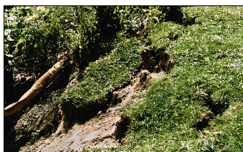
Figure 4. Downslope forces within a bluff cause surface layers to stretch. When the tension becomes great enough, a crack forms and the pressure is released. These "tension cracks" may form on the top edge of the bluff or on the bluff slope itself. They indicate instability and motion within the bluff. Some cracks are deep and extend below the soil layer.