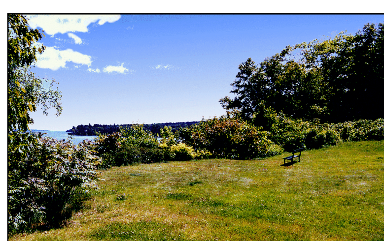
Figure 3. The shape of the top edge of a bluff can be an indicator of landslide risk. Clay bluffs often fail at points of weakness. Such a "slump" can expand into a larger landslide that cuts into the bluff and forms a curve around the original point of failure. Multiple slides and slumps will form an irregular or arcuate top edge to the bluff as shown in the photo above. Bluffs made of coarse materials or sand have a more even upper edge caused by a more constant rate of erosion along the bluff face.