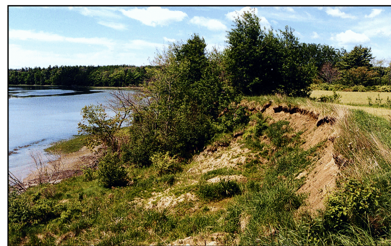
Figure 5. Terraces or a hummocky land surface on the slope of a bluff can indicate a former landslide. Terraces can be the surface of downslope blocks that moved during a slide. Vegetation on the surface of these blocks may be tilted in various directions. The irregular land surface may also occur in a bowl-shaped depression below an arcuate top edge of the bluff, additional evidence of a former landslide.