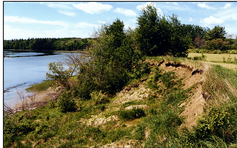
Figure 5. Terraces on a hummocky land surface on the slope of a bluff can indicate a former landslide. Terraces can be the surface of down-sloping blocks which moved during a slide. Vegetation on the surface of these blocks may be tilted in various directions. The irregular land surface may also occur in a bowl-shaped depression below an arcuate top edge of the bluff, additional evidence of a former landslide.