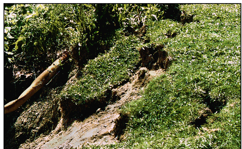
Figure 4. Downslope forces within a bluff cause surface layers to stretch. When the tension becomes great enough, a crack forms and the pressure is released. These "tension cracks" may form on the top edge of the bluff or on the bluff slope itself. They indicate instability and motion within the bluff. Some cracks are deep and extend below the soil layer.