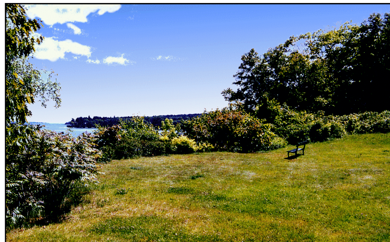
Figure 3. The shape of the top edge of a bluff can be an indicator of landslide risk. Clay bluffs often fail at points of weakness. Such a "slump" can expand into a larger landslide that cuts into the bluff and forms a curve around the original point of failure. Multiple slides and slumps will form an irregular or arcuate top edge to the bluff as shown in the photo above. Bluffs made of coarse materials or sand have a more even upper edge caused by a more constant rate of erosion along the bluff face.