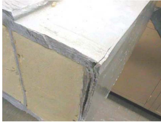
Figure 1: Voids resulting in surface cracks (Ryan et al [1])