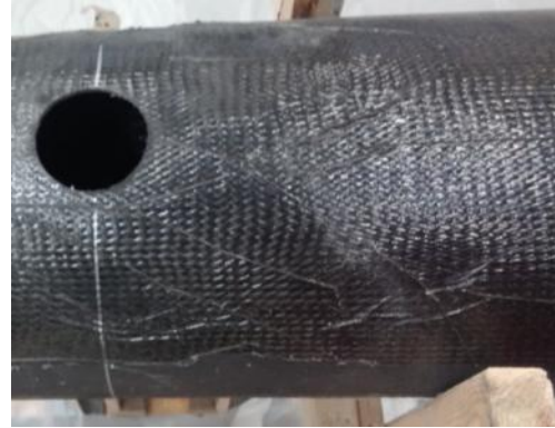
Figure 6: Acceptable resin ridge in the resin layer of a BiaB FRP tube