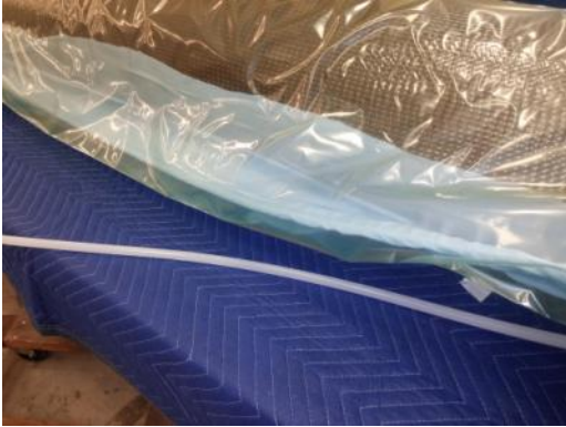
Figure 5: Bagging film ridges acceptable in the resin layer of a BiaB FRP tube