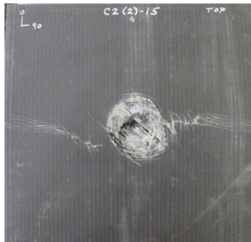
Figure 9: Cracks form around a puncture (Kittridge et al [5])

Cracks can form along with other types of damage, and can lead to fiber exposure. Major cracks should be repaired due to the possibility of decrease of structural capacity or exposure of fibers to damaging conditions. Cracks are shown around a puncture damage area in Figure 9.