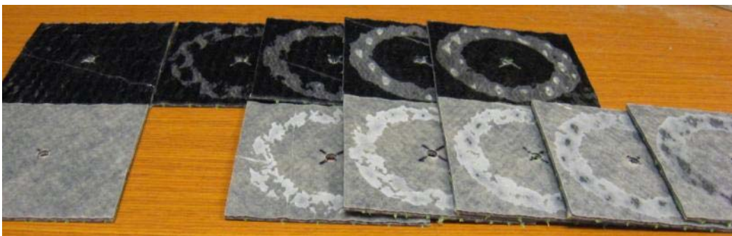
Figure 3: Discoloration due to abrasion, study samples

Discoloration may be indicative of structural problems. Whitening due to abrasion or excessive strain such as that seen in Figure 3 is detectable with visual inspection and can be minor or severe depending on the level of damage to the fibers.