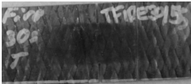
Figure 7: Fibers exposed due to fire damage

Fiber exposure often occurs along with other types of damage, such as punctures, abrasion, fire, or scratches and gouges. This is a serious condition due to the significant exposure to fibers and should be remedied. Along with the fiber exposure shown in Figure 1, Figure 3, Figure 4, Figure 8, and Figure 9, fiber exposure due to fire is shown in Figure 7.