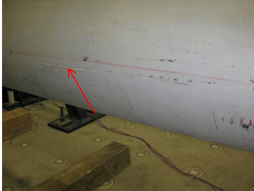
Figure 8: Scratch in FRP pile