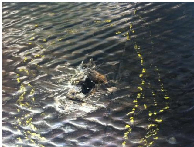
Figure 4: Full puncture/hole in carbon fiber laminate

According to the BRIDGE INSPECTOR'S MANUAL (Ryan et al [1]) punctures, holes, and cracks can result from impact of vehicles, debris such as logs or rocks, or other deficiencies that are left untreated. Full or partial punctures may result in additional cracking and delaminations. A puncture in a BiaB composite CFFT with a puncture can be seen in Figure 4. The damage shown in Figure 4 is quite small, not in a critical location, and therefore not an immediate structural concern, but would need to be sealed with a small surface patch to prevent the ingress of water or chemicals and which could cause future degradation of the FRP.