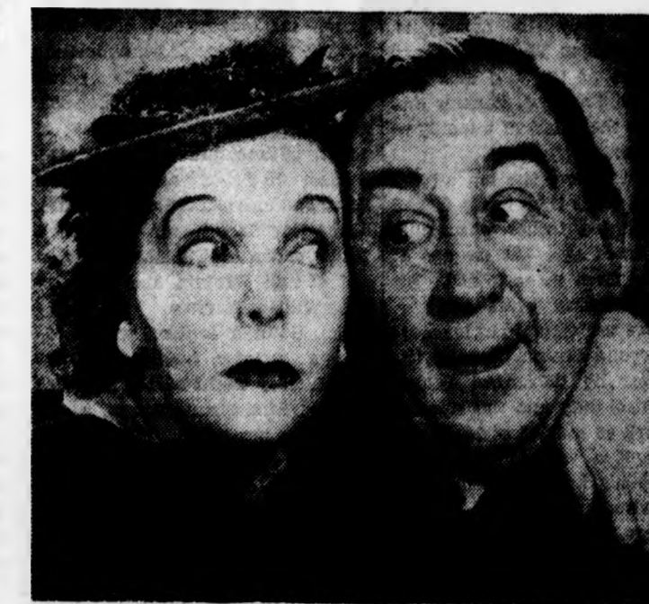
When Zasu Pitts, as a southern belle, makes love to Hugh Herbert, who can the famous loony man do but concede her point. All this happens in the thrilling race-race story, "The Lady's from Kentucky," with George Raft and Ellen Drew co-starred—adv.

Music cleans the brain of sorrow and worry and fits one to take up the load of responsibility with renewed vigor."