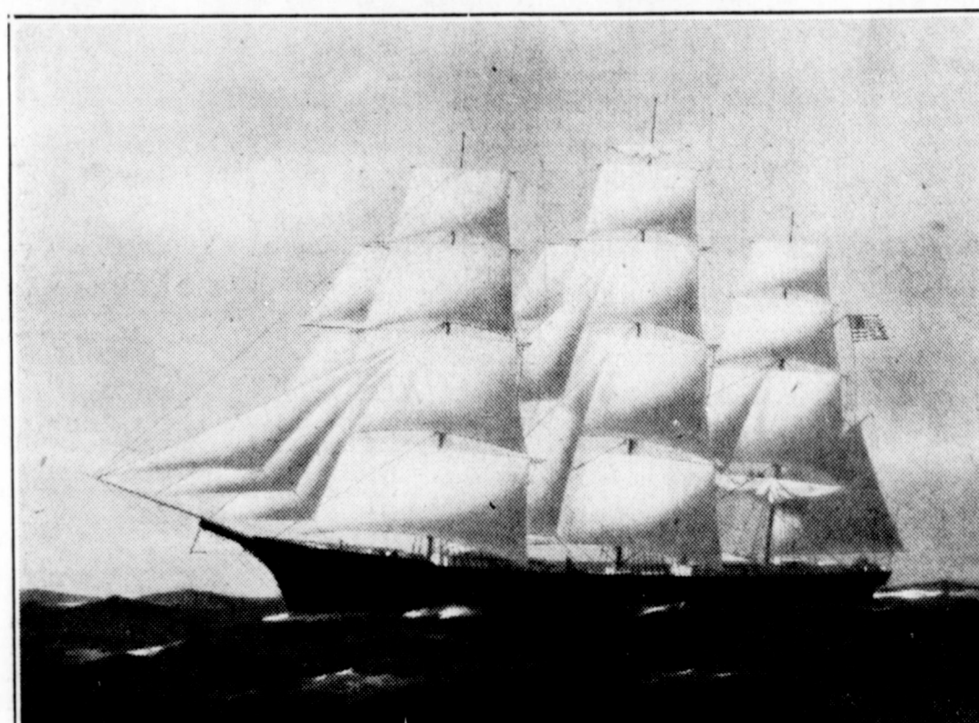
With all sails spread, here's a reminder of the days when ships sailed the seas, and when the Penobscot was adding to the glory of it all.

Members of Limerock Valley Pomona Grange and their numerous guests learned much Saturday night about the early history of the Penobscot Bay region, with especial reference to the subject of shipbuilding. They learned also about the Penobscot Marine Museum which has recently been established at Searsport for the purpose of preserving the shipping records and marine objects of the eastern section of the coast of Maine.