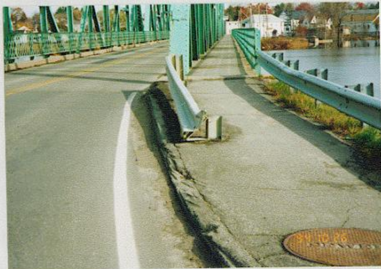
Guard rail Approach