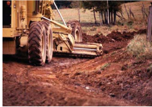
Ditching for Proper Drainage

7:30 Registration/Coffee 8:00 Introduction and Program Begins 9:30 Break 9:45 Program continues 11:30 Lunch 12:15 Afternoon Program Begins 2:15 Break 2:30 Program continues 3:30 Adjourn