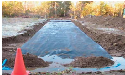
Road Stabilization with Geotextiles