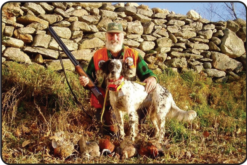
Left & Below: Guinness