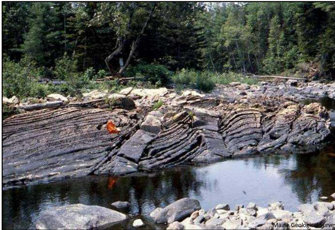
Figure 6. Two granitic dikes near the middle of the image cut across the bedding at a high angle. These are exposed along Moxie Stream about a half mile above the falls, but other dikes are exposed just below the main falls. These dikes are probably related to small granite intrusions in the area.

Figure 6 shows the typical bedding style in The Forks Formation. The more calcareous layers weather more easily while the sandier/siltier layers are more resistant to weathering and erosion. This distinct ribbed characteristic of this outcrop is the result of these differences in weathering.