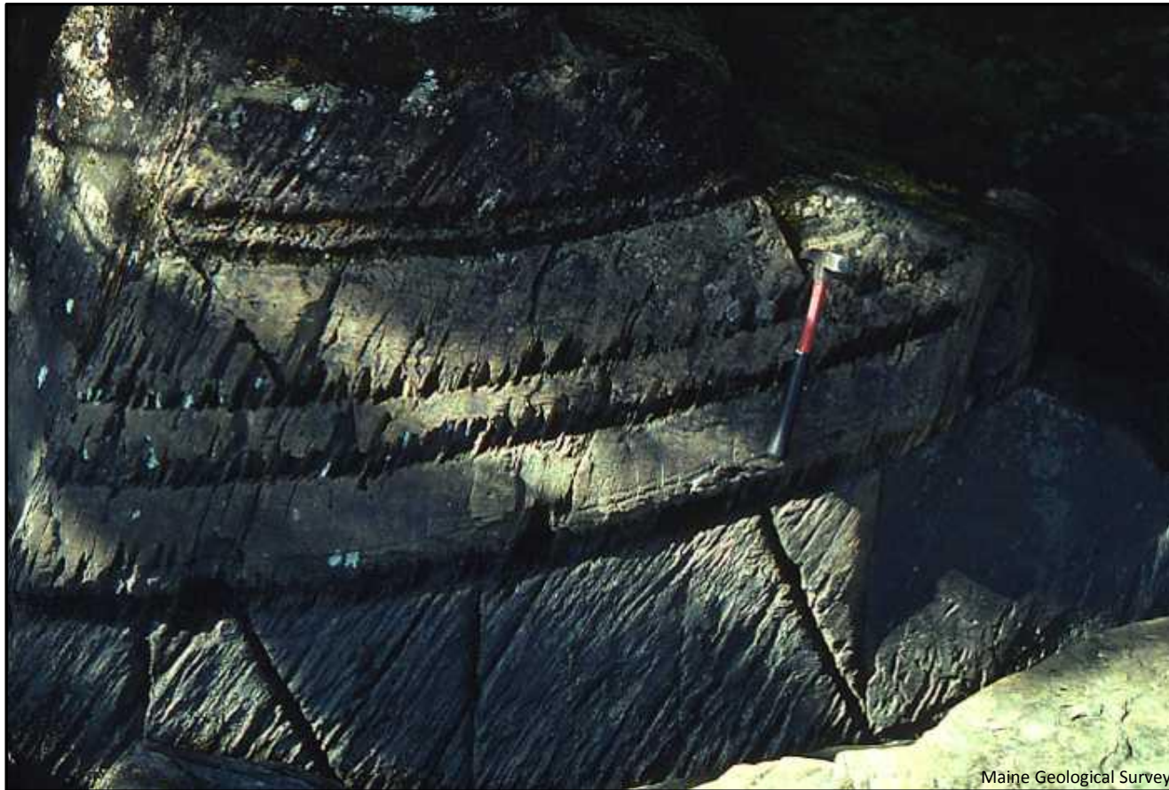
Figure 8. Typical folding in The Forks Formation. Thick calcareous sandstone beds sweep gently upward from lower left to middle right of the image. A strong cleavage has developed in the siltier layer at the bottom of the sequence, and cuts across bedding at a high angle from lower left to upper right. Fine sedimentary layering is visible near the base of the second layer up from the bottom of this sequence.