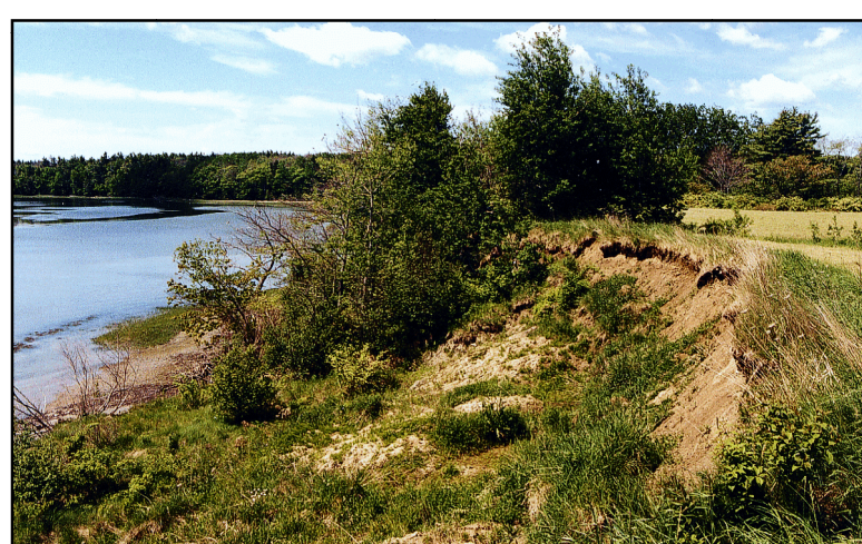
Figure 5. Terraces or a hummocky land surface on the slope of a bluff can indicate a former landslide. Terraces can be the surface of down-sloped blocks that moved during a slide. Vegetation on the surface of these blocks may be tilted in various directions. The irregular land surface may also occur in a bowl-shaped depression below an arcuate top edge of the bluff, additional evidence of a former landslide.