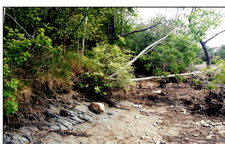
Figure 7. Wave erosion at the base of a bluff removes slope sediment and steepens the bluff. Erosion has undercut the trees in the photo above and caused them to tilt toward the ocean. This steepening reduces the stability of the bluff, and a landslide may result. Ongoing sea-level rise along the Maine coast will cause wave erosion at the base of coastal bluffs and continue to make some coastal bluffs at risk of experiencing a landslide.