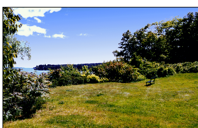
Figure 3. The shape of the top edge of a bluff can be an indicator of landslide risk. Clay bluffs often fail at points of weakness. Such a "slump" can expand into a larger landslide that cuts into the bluff and forms a curve around the original point of failure. Multiple slides and slumps will form an irregular or arcuate top edge to the bluff as shown in the photo above. Bluffs made of coarse materials or sand have a more even upper edge caused by a more constant rate of erosion along the bluff face.