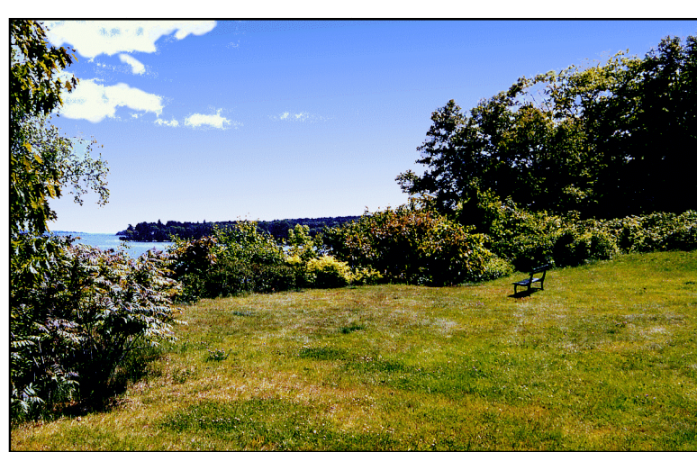
Figure 3. The shape of the top edge of a bluff can be an indicator of landslide risk. Clay bluffs often fail at points of weakness. Such a "slump" can expand into a larger landslide that cuts into the bluff and forms a curve around the original point of failure. Multiple slides and slumps will form an irregular or arcuate top edge to the bluff as shown in the photo above. Bluffs made of coarse materials or sand have a more even upper edge caused by a more constant rate of erosion along the bluff face.