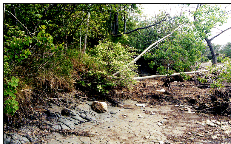
Figure 7. Wave erosion at the base of a bluff removes slope sediment and steepens the bluff. Erosion has undercut the trees in the photo above and caused them to tilt toward the ocean. This steepening reduces the stability of the bluff, and a landslide may result. Ongoing sea-level rise along the Maine coast will cause wave erosion at the base of coastal bluffs and continue to make some coastal bluffs at risk of experiencing a landslide.