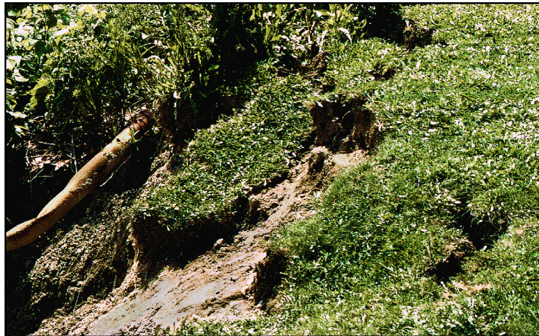
Figure 4. Downslope forces within a bluff cause surface layers to stretch. When the tension becomes great enough, a crack forms and the pressure is released. These "tension cracks" may form on the top edge of the bluff or on the bluff slope itself. They indicate instability and motion within the bluff. Some cracks are deep and extend below the soil layer.