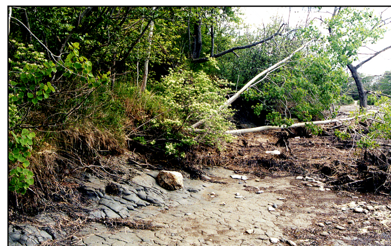
Figure 6. Wave erosion at the base of a bluff removes slope sediment and steepens the bluff. Erosion has undercut the trees in the photo above and caused them to tilt toward the ocean. This steepening reduces the stability of the bluff, and a landslide may result. Ongoing sea-level rise along the Maine coast will cause wave erosion at the base of coastal bluffs and continue to make some coastal bluffs at risk of experiencing a landslide.