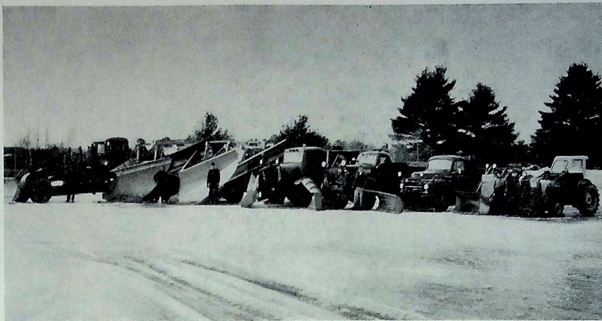
This Is Your Road Department Equipment