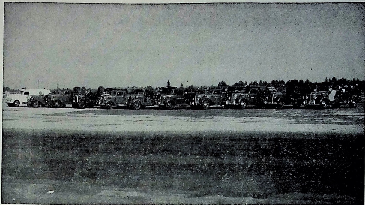
This Is Your Fire Department Equipment