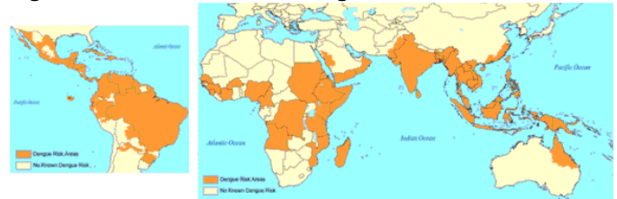
Map: Federal CDC