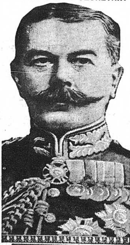
Earl Kitchener, who was recalled to London as he was leaving England for Egypt and appointed secretary of state for war.