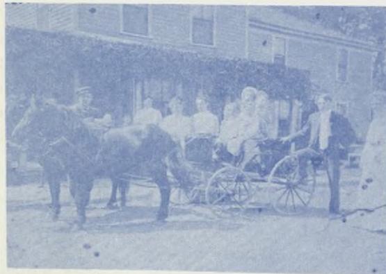
Picture taken in front of the "Boyden House", the present day site of the "Executive Motel".