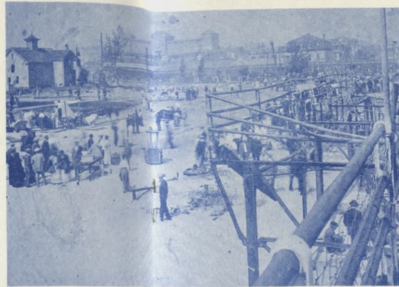
Aftermath of "The Big Fire of 1907". Photo taken from pier. Note popcorn machine of John Lutz.