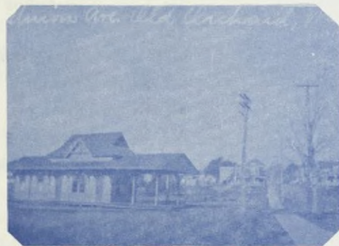
"Camp Ground" Railroad Station, foot of Union Ave. where present day (1976) parking lot is.