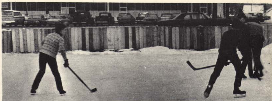
Skating for All Ages at the Rink on the School Grounds