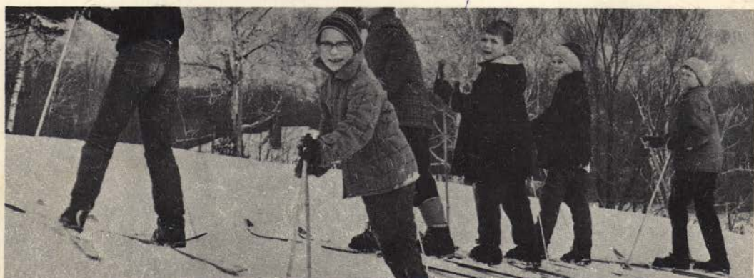
Ski Instructions for Children at No-Par Ski Slope