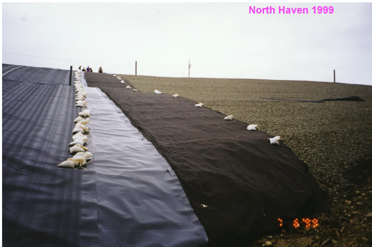
Figure 2: Capping the North Haven Landfill in the Summer of 1999