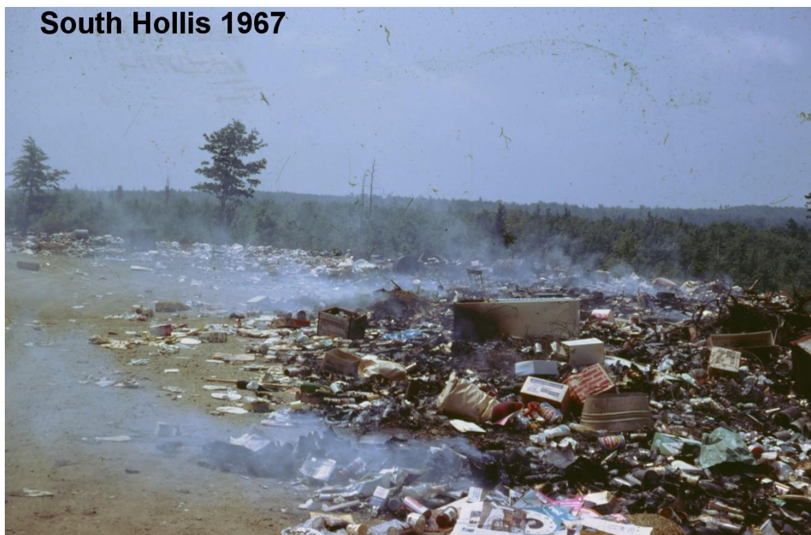
Figure 1: A Typical 1960's Maine Landfill that Sparked Establishment of the Program