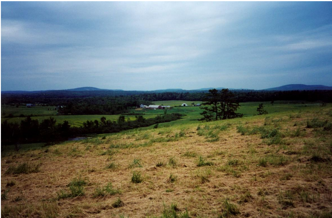
Figure 3: Closed Municipal Landfill in Belfast, Maine, 2000