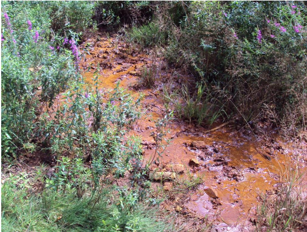
Figure 7: Leachate Breakout Near the Portland Trails Pathway, Ocean Ave Landfill, 2009

implementation of limited field investigations. This activity is to determine that the caps, gas mitigation systems, and other elements of the closure system are being maintained and are functioning as intended. DEP's technical assistance to municipalities is crucial to determining when remedial actions are necessary to protect human health, and when unnecessary actions would only create needless cost. Our experience has been that local historical memory of these sites lasts for about 25 years after landfill closure due to changes in the local population. In the long term, the DEP will become the repository of site knowledge for developers inquiring as to the nature of the site and its potential impact to the surrounding area.