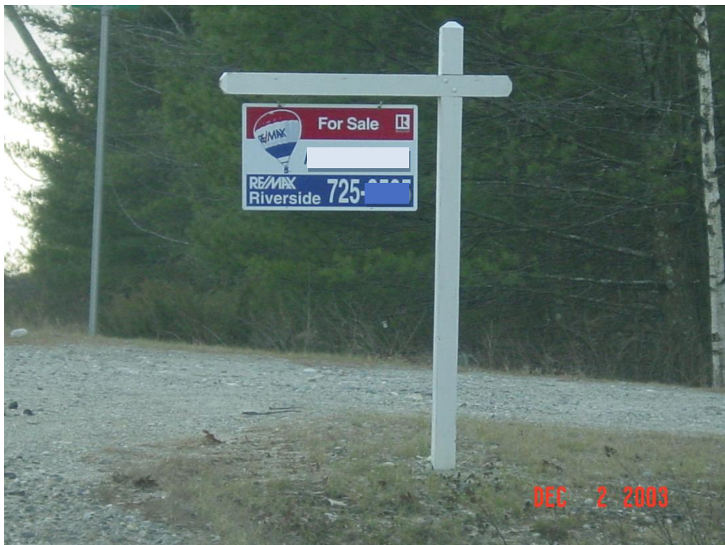
Figure 8: Development Pressure has Increased Near Closed Landfills

Between 1988 and 2000 DEP's Municipal Landfill Closure and Remediation Program oversaw the expenditure of $79,000,000 in State match funds on the successful closure of 397 unlined municipal landfills. The DEP anticipates expending another $3,390,000 for the closure of 5 more landfills. These actions complemented the development of modern day landfills under the DEP's Solid Waste Rules. Since 2000, the Municipal Landfill Closure & Remediation Program has incurred an additional $2,574,034 in match obligations for remedial actions near these closed municipal landfills, and anticipates incurring another $935,000 in match obligations through CY 2015 for additional remedial actions. The total unmet State match obligation to Municipalities through CY 2015 is estimated to be $6,899,034, plus DEP staff costs to provide technical support and other oversight activities.