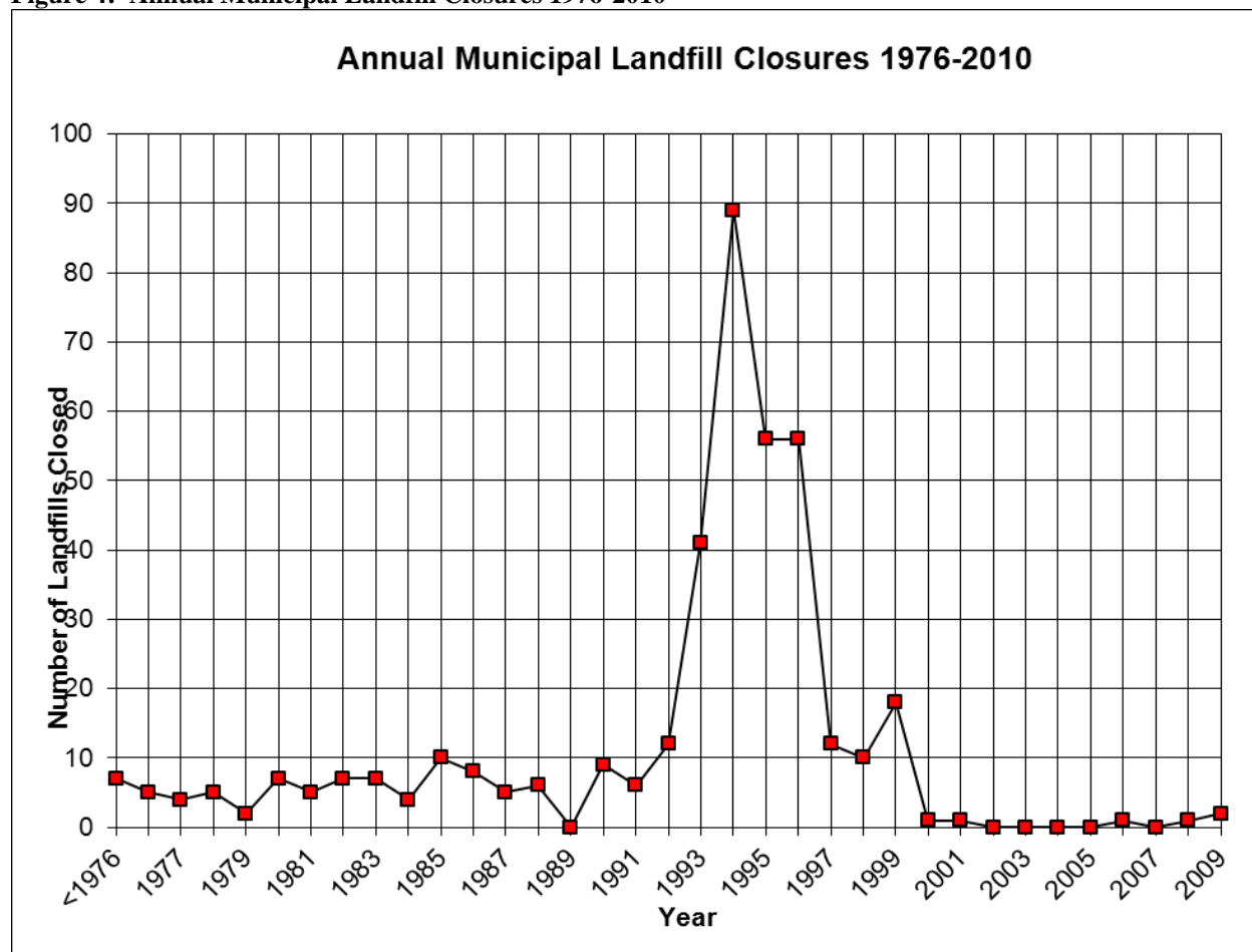
Figure 4: Annual Municipal Landfill Closures 1976-2010

From 1976 to June of 2011, a total of 397 unlined municipal landfills across Maine, totaling 1,769 acres, have been successfully capped under this program, significantly reducing threats to public health and the environment. As shown in Figure 4, a significant majority of these closures took place from 1993 through 1996, sparked by legislative changes that eased the closure specifications and set a deadline for conducting reimbursable activities. The success of this program can be attributed to legislative leadership, public support, technical support from the DEP, and public funding to municipalities. A list of Landfills in the program is included in Appendix 1 on page 13.