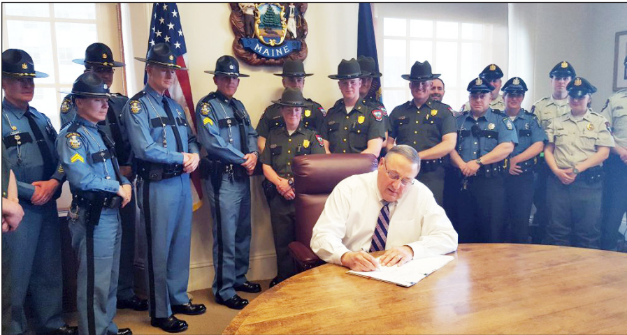
The Governor signed LD 1523 to give pay raises to law enforcement officers.