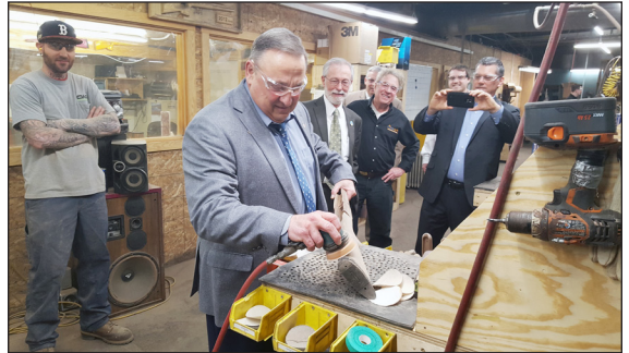
Governor LePage, who worked for decades in the forest products industry and as a consultant for manufacturing companies, sands a rifle stock at Cousineau Wood Products in North Anson.