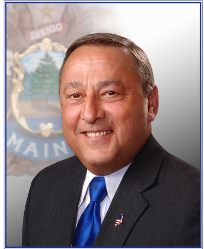
Governor Paul R. LePage