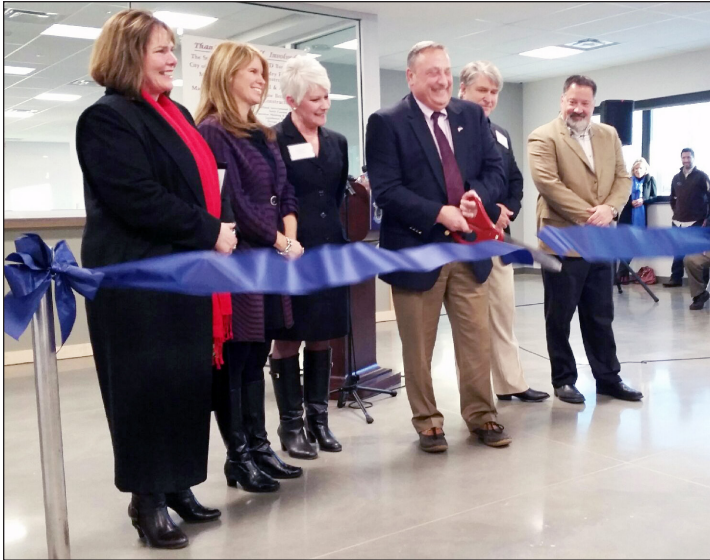
Governor LePage used his business acumen to combine DHHS and Department of Labor offices in a new South Portland facility, saving taxpayers millions of dollars.