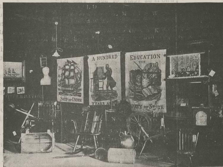
Corner of the Antique Room

On Tuesday, the day set as Children's day by the committee of Old Home