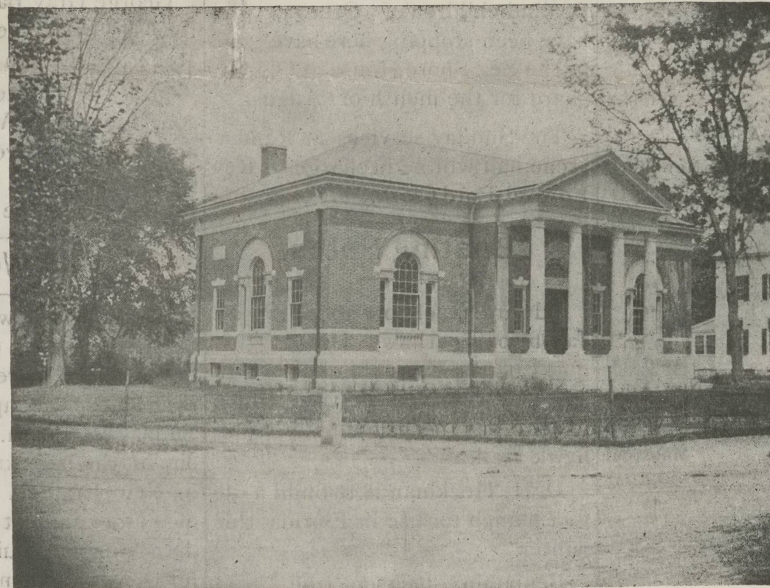
Parson's Public Library, dedicated Friday