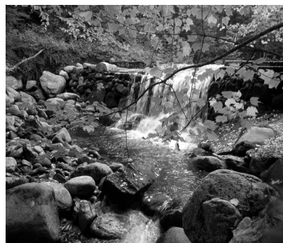
Bethel Water Source

Divers from Waterworks Diving were hired to repair the leak but were unable to do so because of the angle created by soil accumulation below the pipe that separated it at a bell. In the interim, District staff, with support from other community agencies, made a temporary river crossing by connecting fire hydrants on either side of the river with fire hoses running along a bridge. With flow to the system reduced by half, a water conservation order was issued by the District in an effort to reduce the pumping demands that had been placed on the system and allow the reservoir to begin to fill again.