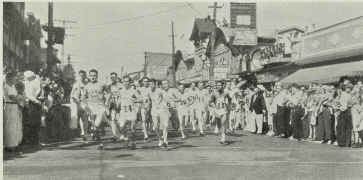
MARATHON RACE AT OLD ORCHARD BEACH