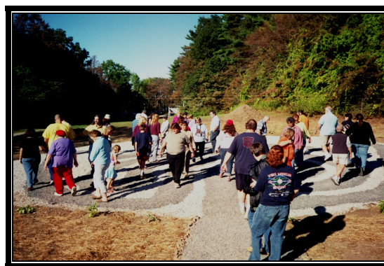
Labyrinth on Mackworth Island