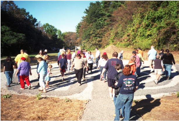
Community members walking through the Labyrinth for the first time.

A labyrinth is an ancient symbol that relates to wholeness. It combines the imagery of the circle and the spiral into a meandering but purposeful path. The labyrinth represents a journey to our own center and back again out into the world. Labyrinths have long been used as meditation and prayer tools.