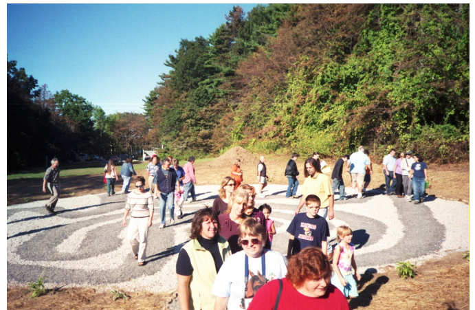
Community members walking through the Labyrinth for the first time.

The Labyrinth on Mackworth Island is part of the healing process from the abuse that occurred at Governor Baxter School for the Deaf and is supported by Safer Place and other members of the community.