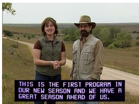
Example of Closed-Captioning

Closed captioning is a technology that provides visual text to describe dialogue, background noise and sound effects for television programming. The audio portion of programming is displayed as text superimposed over the video.