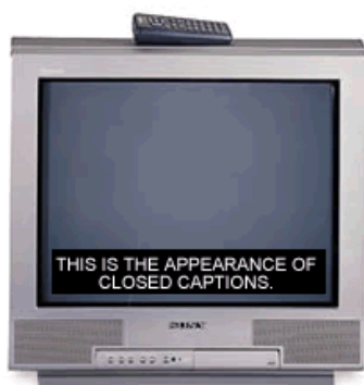
Example of Closed Captioning