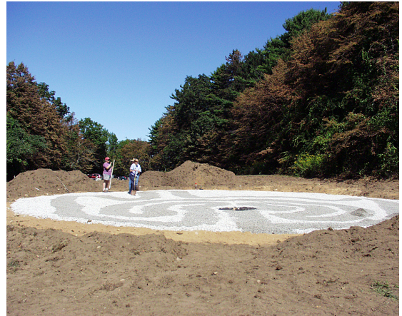
Putting the finishing touches to the Labyrinth

A labyrinth, unlike a maze, has no dead ends. There is only one path, and while it does have twists and turns, you can't get lost. The same path takes you into the labyrinth and out again. With a labyrinth you don't have to think, or analyze, or solve a problem; you just trust that the path will lead you to where you need to be.