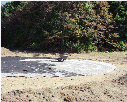
Beginning work on the Labyrinth

A labyrinth is an ancient symbol that relates to wholeness. It combines the imagery of the circle and the spiral into a meandering but purposeful path. The labyrinth represents a journey to our own center and back again out into the world. Labyrinths have long been used as meditation and prayer tools.