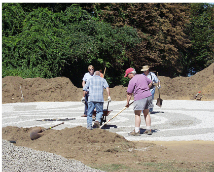
Working on the Labyrinth

A labyrinth looks like a maze but is not. A maze is like a puzzle to be solved. It has twists and turns and dead ends. You have to think and be alert for any clues you may find. A maze can be frustrating, frightening, or challenging. You can get lost in a maze.