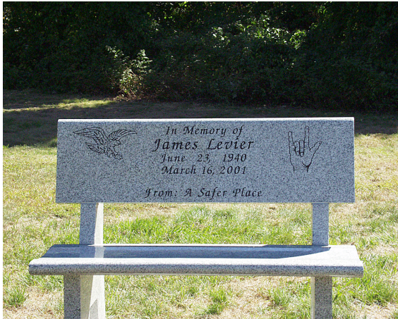
James Levier bench on Mackworth Island

The dedication of the bench and tree in memory of James Levier at GBSD took place on September 24, 2005 on Mackworth Island.