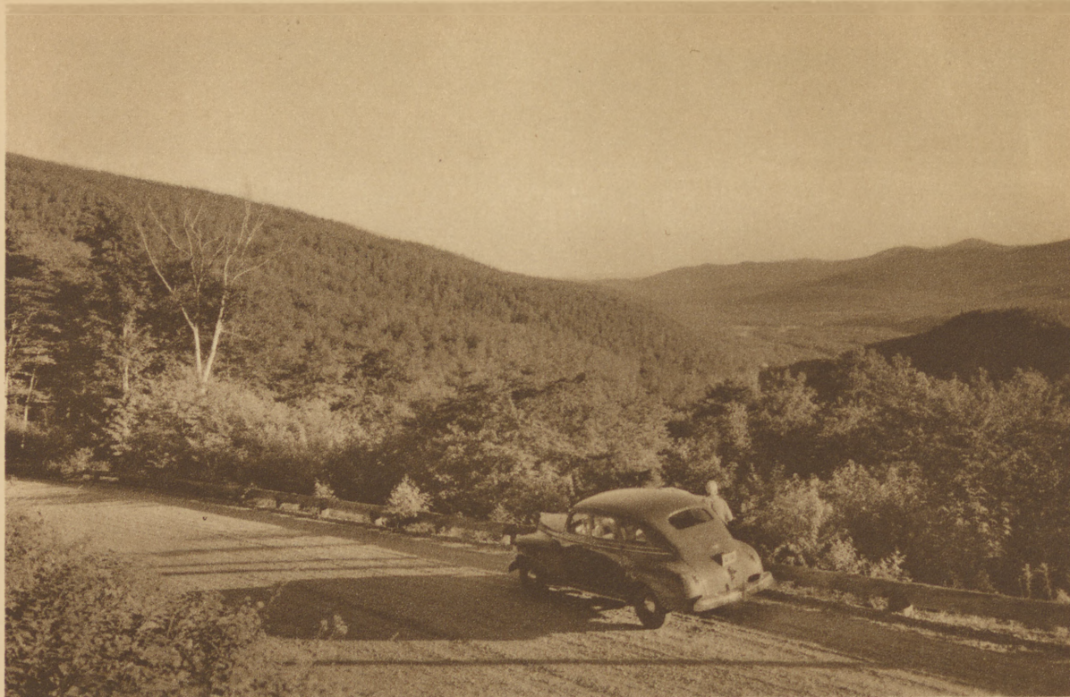
Smooth highways connect one beauty spot with another, an amazing diversity of scenery found nowhere else.