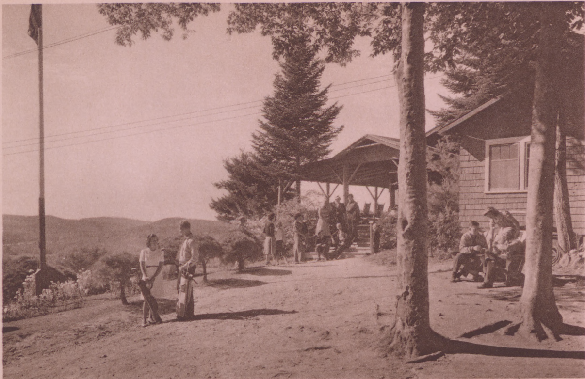
At a Maine sporting camp or hotel, hospitality and friendliness reign supreme. Old friends are remembered and new ones easily made.