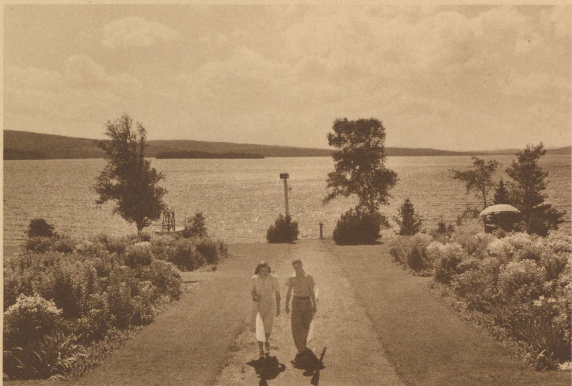
Maine lakes are noted for their purity. Fortunate indeed is the person who can leave the city and spend a part of each year near these beautiful lakes.