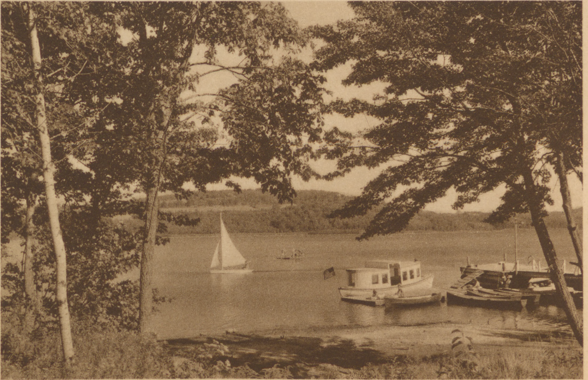
Picturesque log cabins with "all the comforts of home" and endless opportunities to enjoy outdoor sports make a vacation in the lake country "just what the doctor ordered."