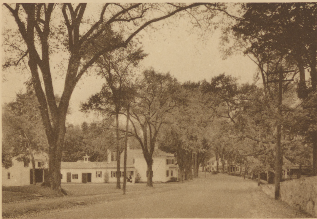
There are many Maine villages with their white houses and wide streets that have changed little in a century.