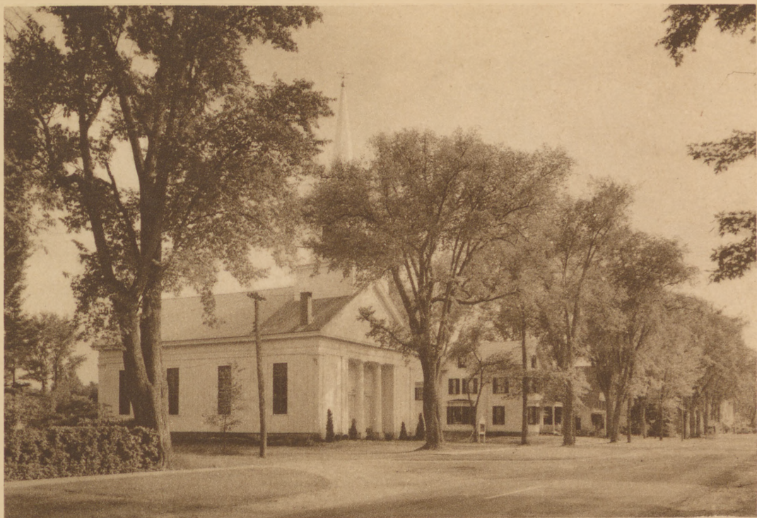
The white church spire, the wide village street, the elm tree— all typical of Maine.