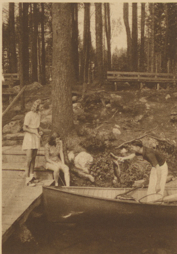
Fun and excitement on the lake followed by a lunch, rest and relaxation on shore.