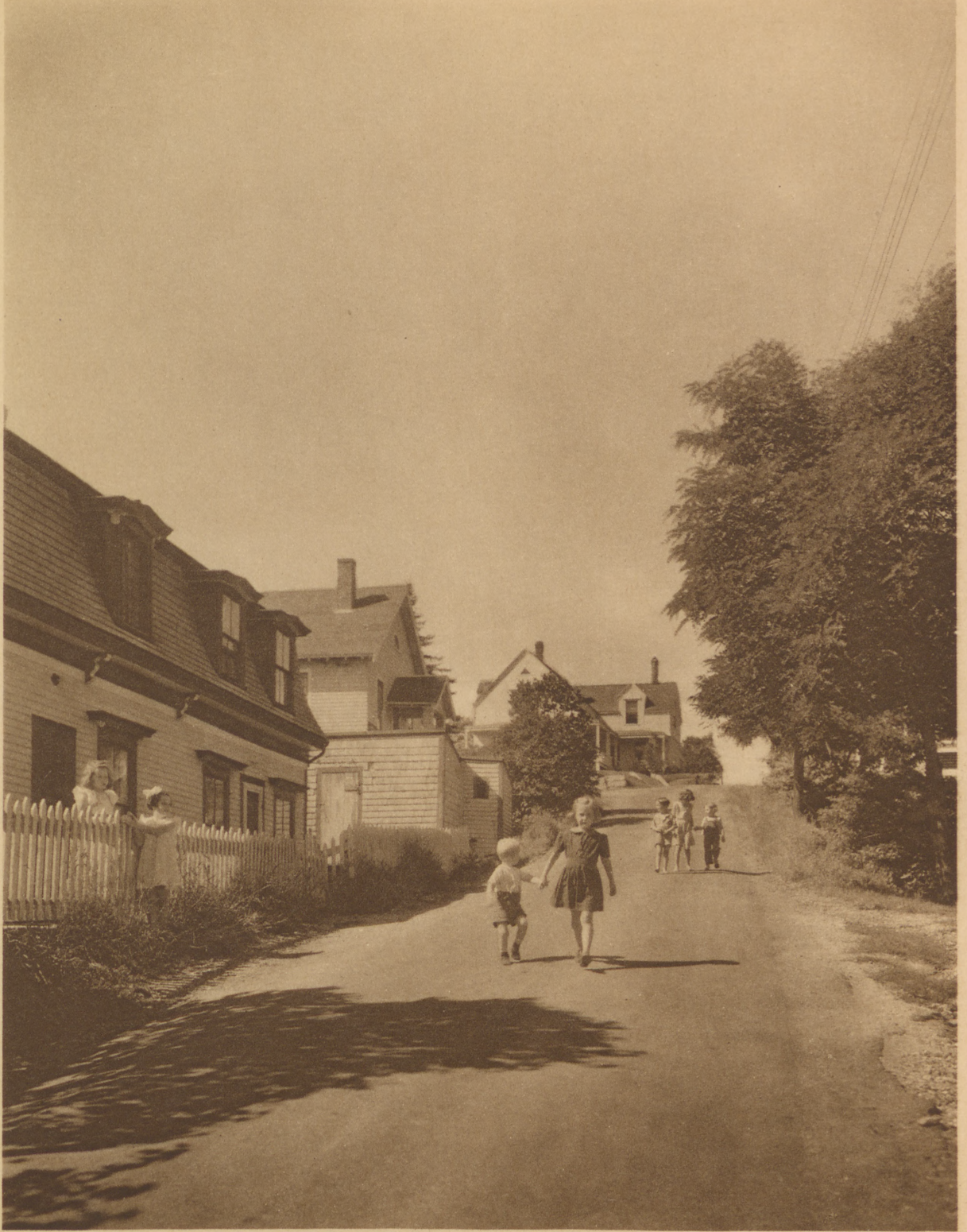
In the everchanging aspect of Maine that the visitor sees as he travels from one end of the state to the other are villages like this. Here in Maine sunshine and pure air children grow to manhood and womanhood with health and character born and developed in them.