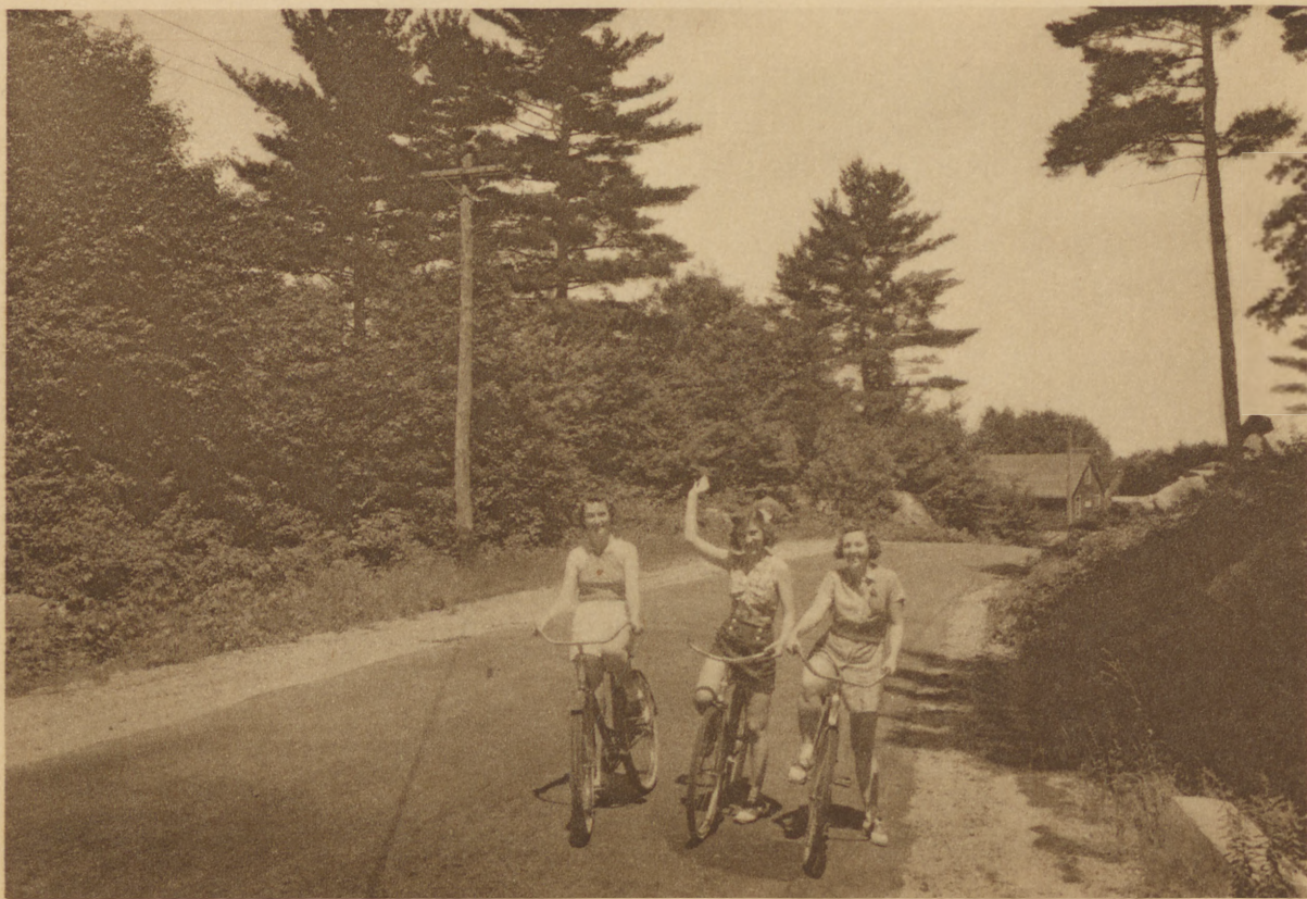
It is quite the thing these days when you get to Vacationland to leave the motor car and propel yourself along these trails and back country roads.