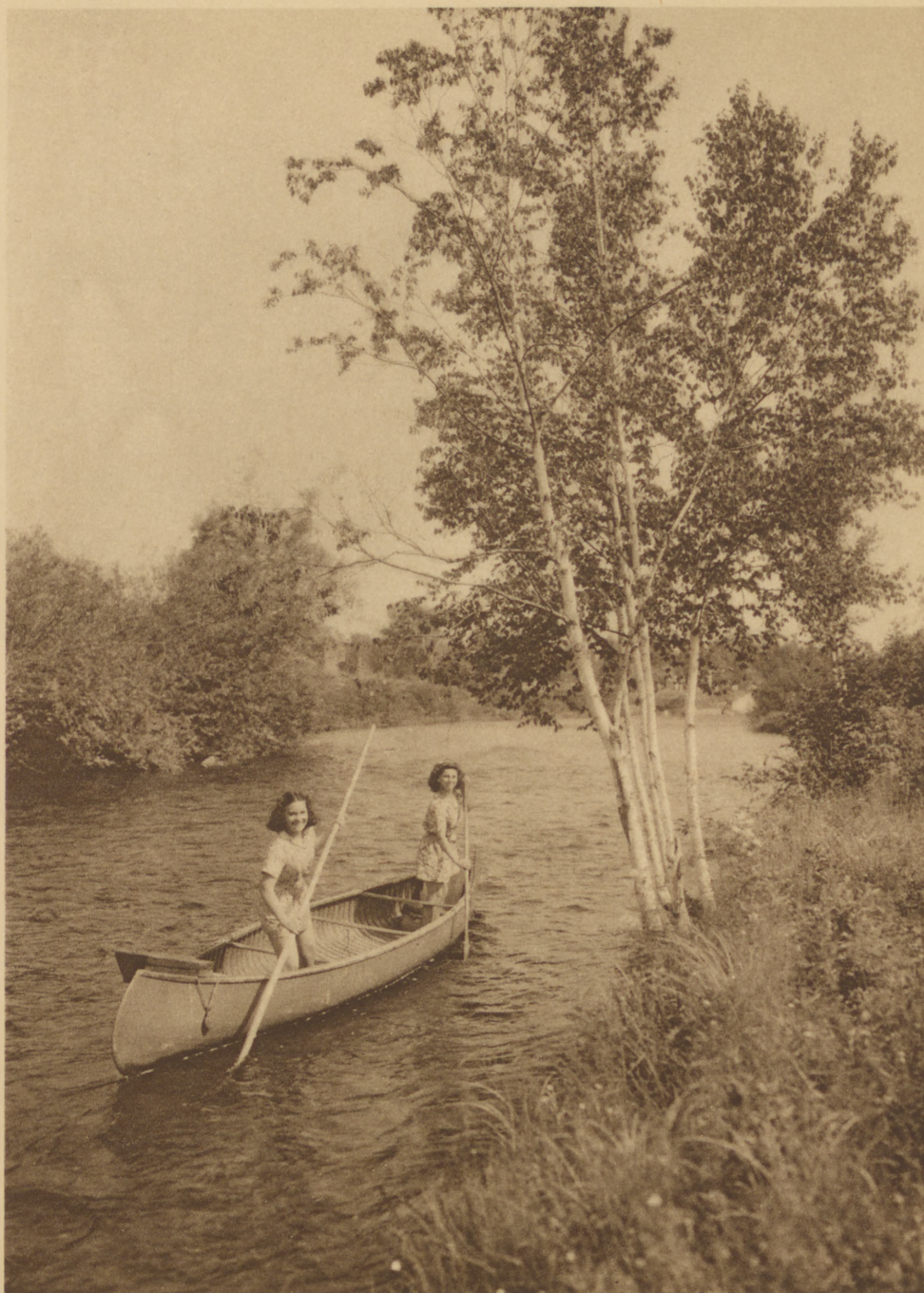
All kinds of canoeing may be enjoyed in Maine. Poling a canoe up a swift stream is an invigorating experience well worthwhile. Add to this the scenery and wild life that may be observed as you go along and you have a perfect vacation.