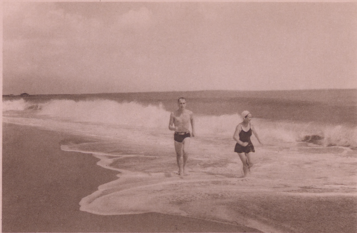
Stretched along the southern Maine coast is mile after mile of the finest ocean beaches in the world.