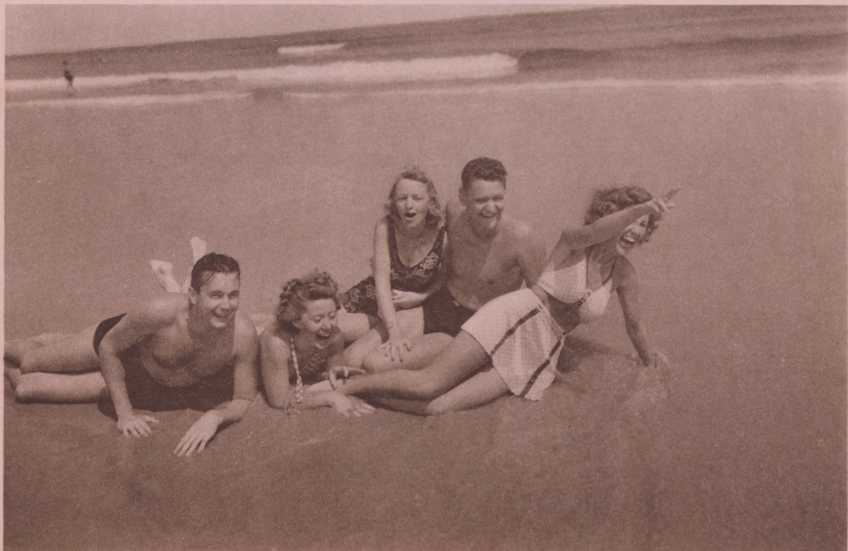
Old and young, active and indolent—all find that the Maine beach, where glorious sunshine is tempered by cooling summer breezes, is an ideal vacation spot.