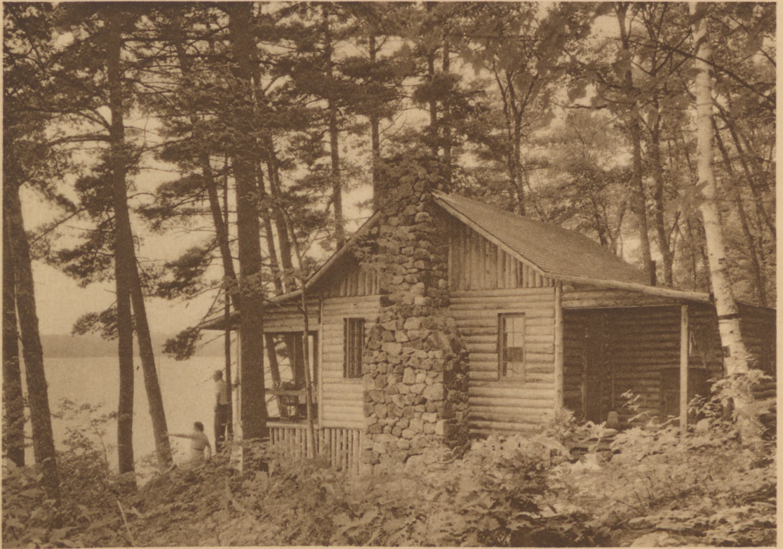
Maine is the place for children. Thousands of them come from all over the country to summer at one of Maine's two hundred boys and girls camps. Many more come with their parents, all benefiting greatly from the perfect Maine climate.