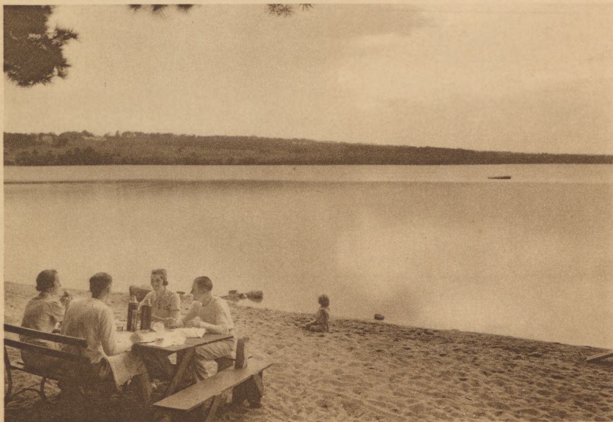
After activity in the open it is good to drink in the Maine sunshine whether you are eating your lunch or just sitting looking at the view spread out before you.