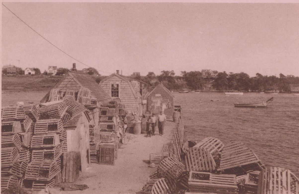
Maine coastal highways lead along by the water's edge and through many little fishing villages. These picturesque villages have been the inspiration for artists and writers for many years.