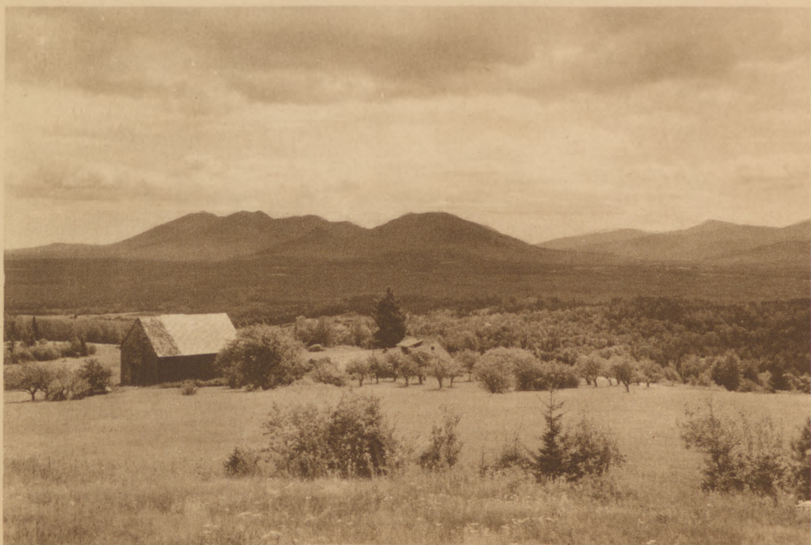
One gets a new perspective from the top of a mountain. All Maine is unfolded in a panorama of unsurpassed beauty as a reward for those who climb these peaks.