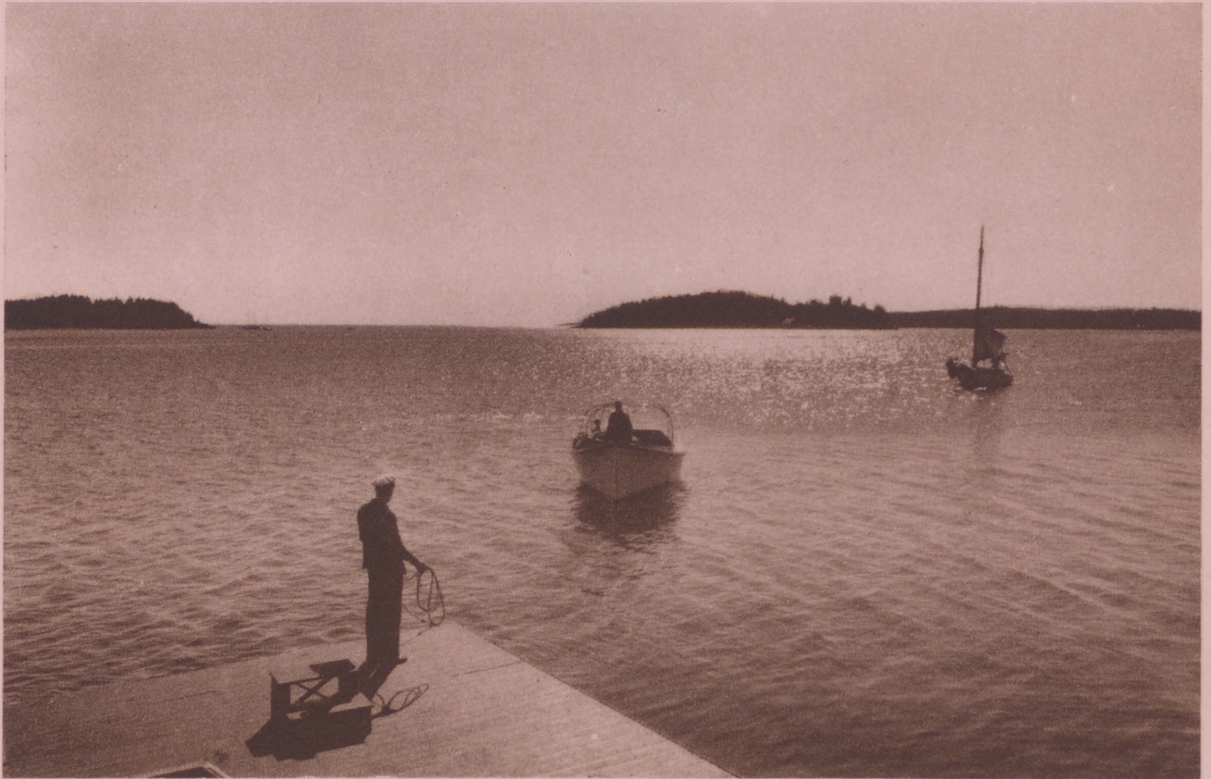
The Maine coast is different than any other coast in the world. Enchanting little islands are literally strewn along the entire coastline. Unforgettable, beautiful, snug harbors add to the enchantment of these scenes.