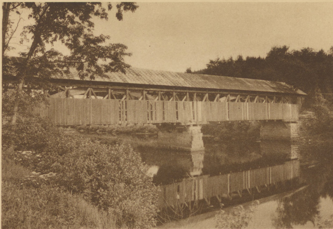
The covered bridge, a relic of the horse and buggy days, is only one of the many things of yesterday that may be observed in Maine.