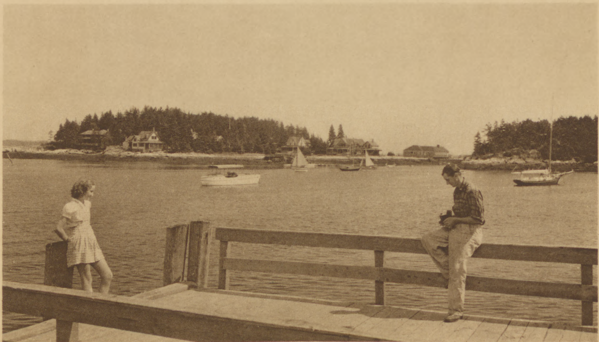
The camera is an important accessory to any Maine vacation. The vacationist always wants to take home with him the pictures that he sees.