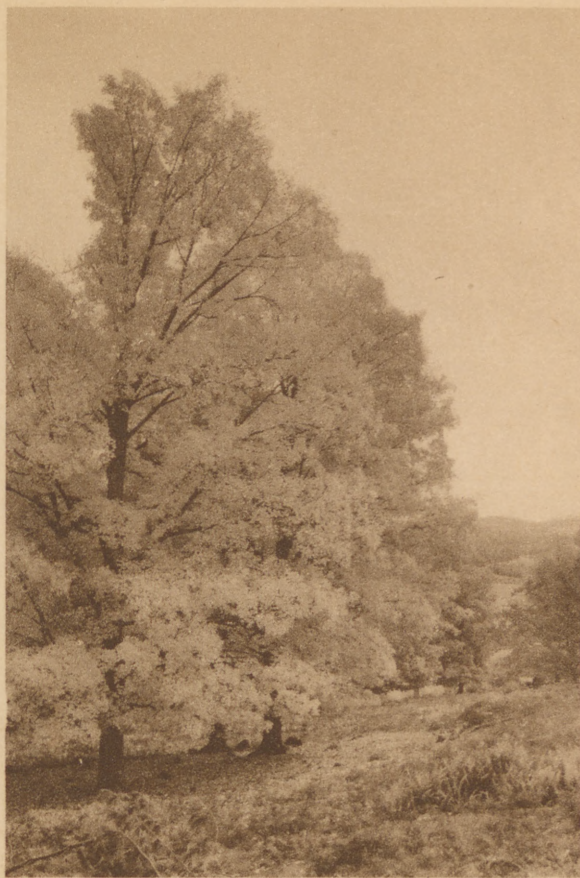
In the autumn Maine is a place of wondrous beauty. Then nature puts on her brightest dress to welcome the hunter and others who have found it an ideal vacation season.