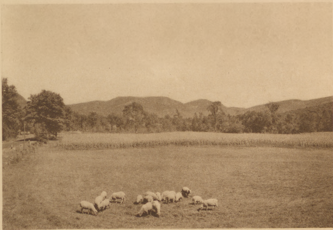
The Maine countryside is clothed with scenes of peace and stability.