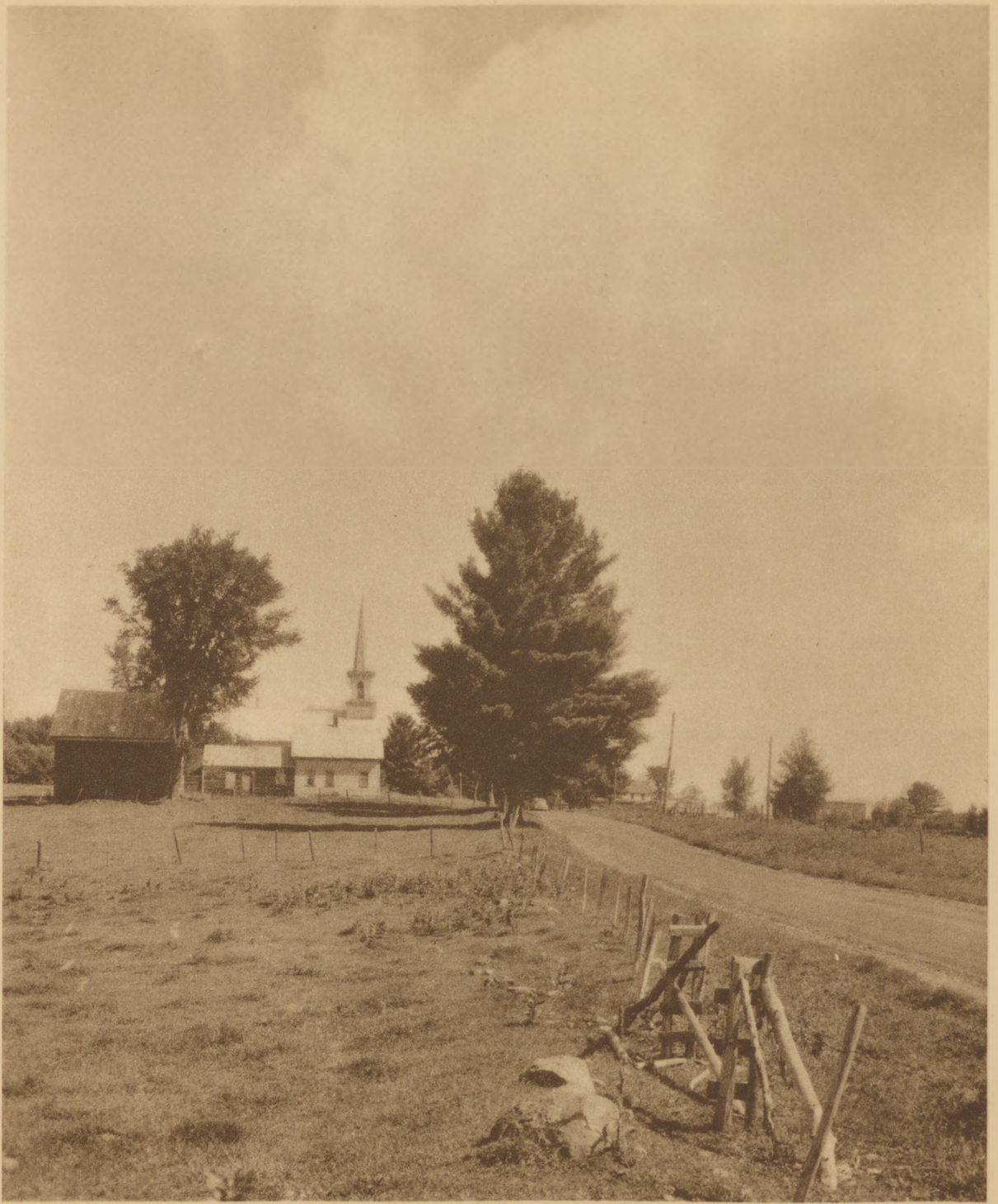
Long before he can see anything else on approaching many a Maine village, the motorist will come within view of a church. Maine's village churches are as simple and as forthright as the belief that is taught within their walls. They are symbols of all that Maine means—the right to live and worship in freedom.