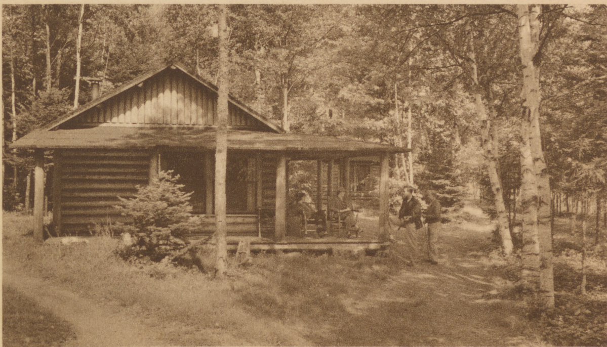
New friends and old meet in the Maine woods. Here nature reigns supreme.