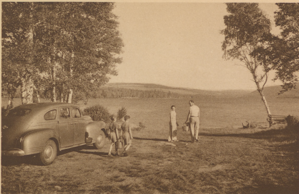
Far away from the hustle and bustle of the city the whole family enjoys a quiet picnic on the shore of a beautiful Maine lake.