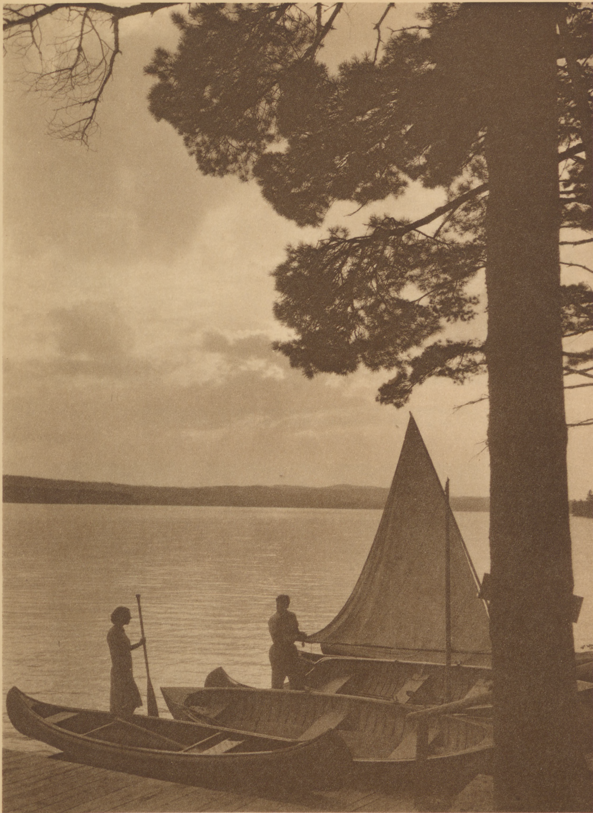
A pine tree silhouetted against the evening sky is one of the golden memories cherished by those who have visited Maine. The long Maine evening is, to many, the most pleasant time of the day. The day's adventures over, it is time to gather with companions to watch the sun sink behind the hills and to see the stars appear one by one in the summer sky.