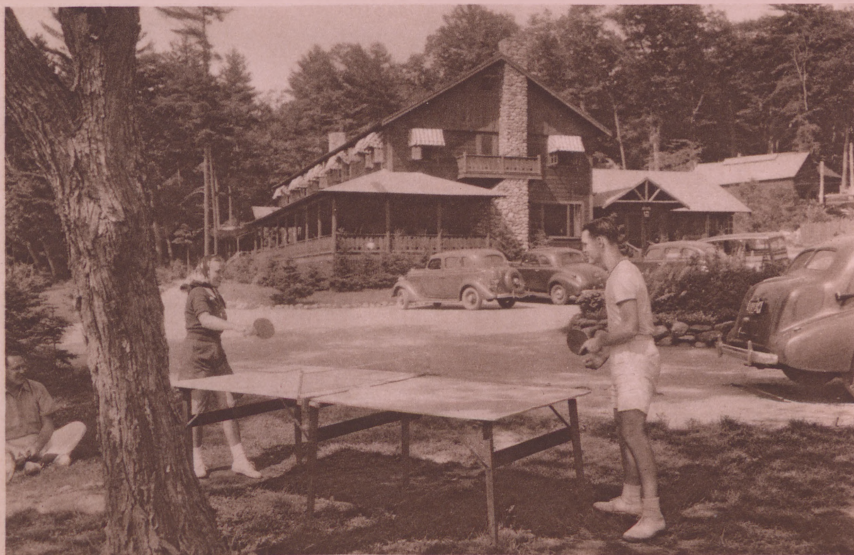
Outdoor exercise of all kinds, invigorating air, healthful climate and good food—these are the things that make people return to Maine year after year.