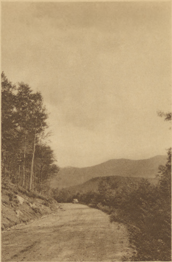
Sailing on a Maine lake and motoring through the mountains are only two of the many vacation pleasures.