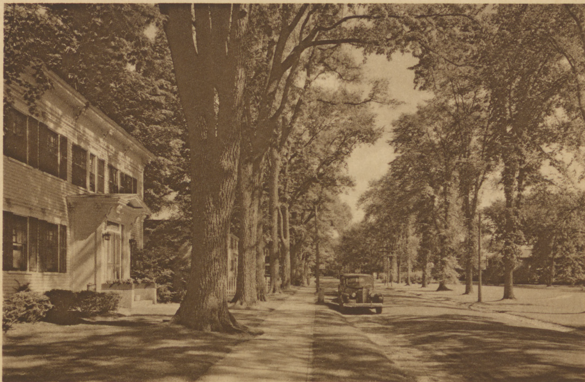
A quiet Maine village where the term "neighbor" attains its richest meaning, a place that is a haven of peace for persons tired of the rush of cities.