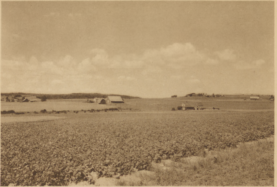
Motoring through Maine's potato region in blossom time is an experience long to be remembered.