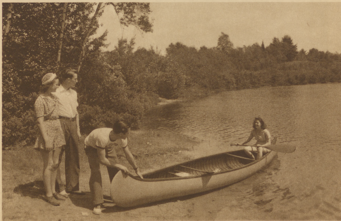
Connecting links of lakes, rivers and streams form a water highway that penetrates deep into some of the most scenic country in the world.