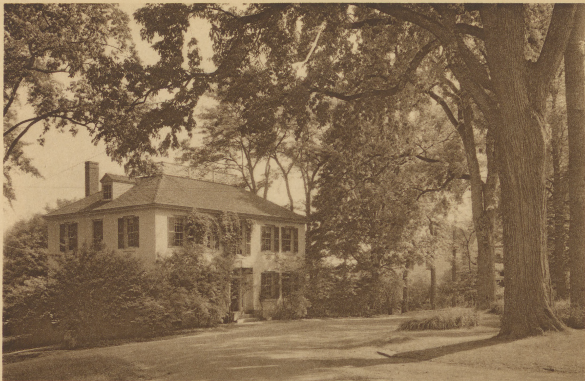
A century old house, spacious grounds, spreading elm trees— that is home, real home.