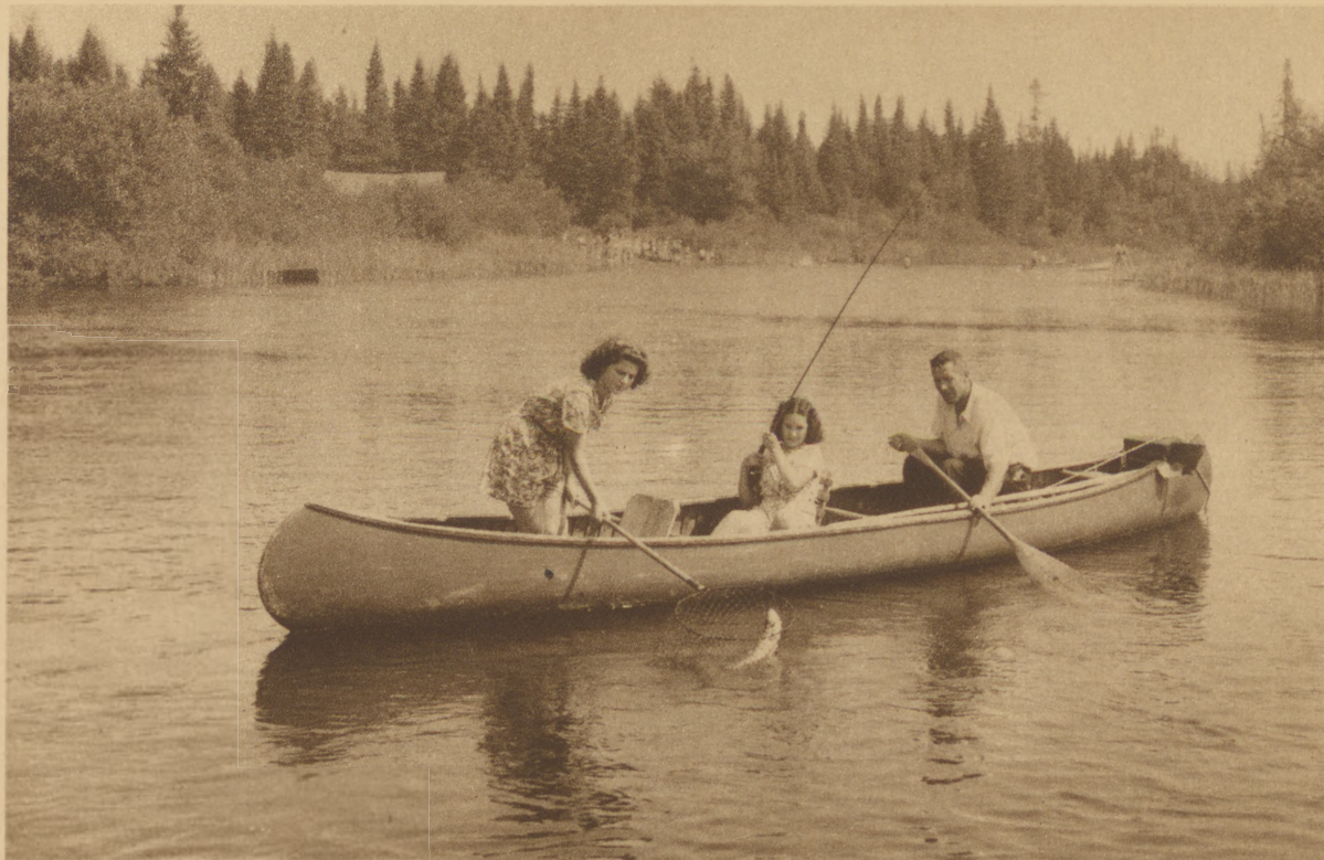
Today fishing is more than a man's sport. It is fun for the whole family.