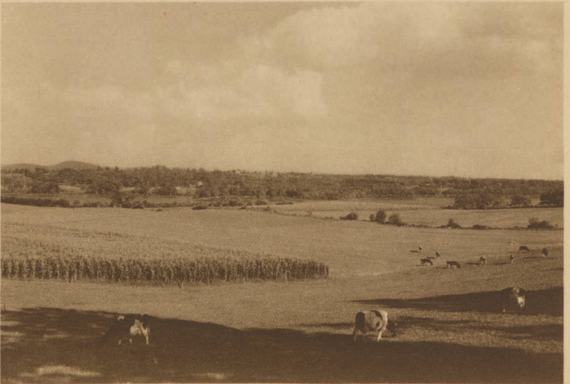
There is no monotony in the Maine countryside. Around every curve in the road is an everchanging picture of beauty, serenity and peace.