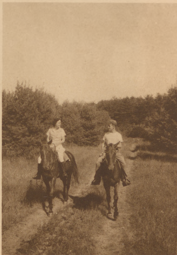
Maine golf courses are laid out so that players may enjoy to the utmost Maine's scenic beauty. Riding trails, too, were planned to give the rider absorbing views of woodlands, mountains and lakes.