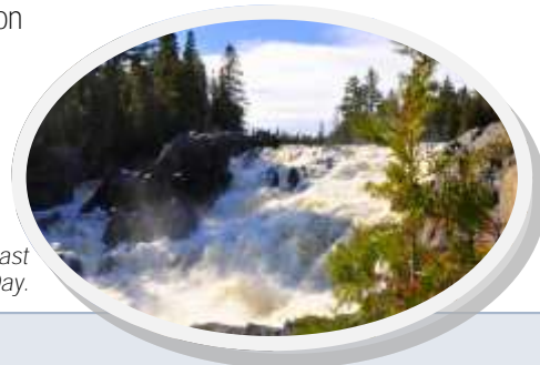
Allagash Falls, East

The Allagash Wilderness Waterway provides the following materials to the public. All are free unless otherwise noted.