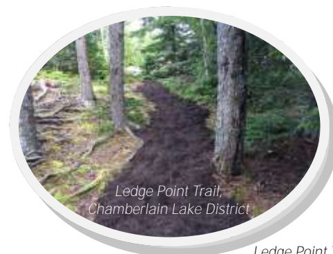
Ledge Point Trail, Chamberlain Lake District

Ledge Point Trail