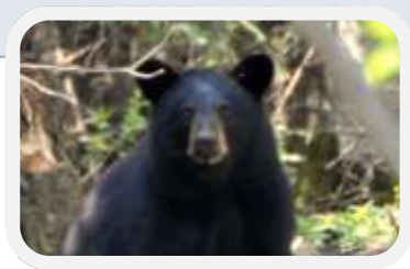
Black Bear: Photo by Steve Day

Note: The AWW is required by Statute, Title 12 section 1882.3, to maintain 19 snowmobile access points to the watercourse.