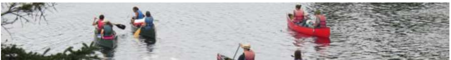
Paddling: Photo by Steve Day

AWW Donations Account: $26,270.59 was in the Allagash Wilderness Waterway donations account as of June 30, 2015.