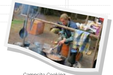
Campsite Cooking