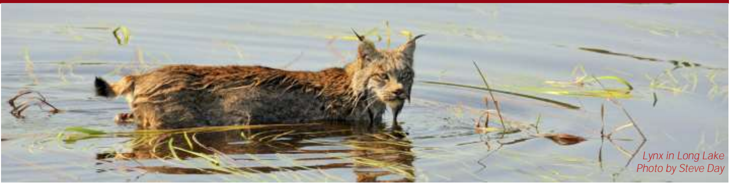
Lynx in Long Lake