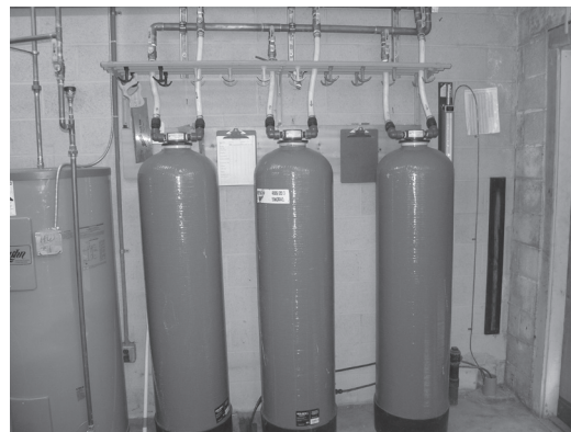
An Arsenic Removal Treatment System

Which water systems are eligible? Eligible water systems include all community systems (except those regulated by the Public Utilities Commission) with a population of 100 or less, and all not-for-profit, non-transient, non-community water systems. Examples include: mobile home parks, apartment buildings, nursing homes, and schools. Projects cannot be the result of a failure to maintain an existing treatment system.