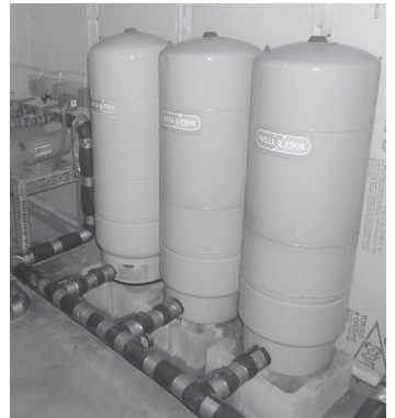
Example of Pressure Tanks: Note only one pipe serves as both inlet and outlet, no separate outlet