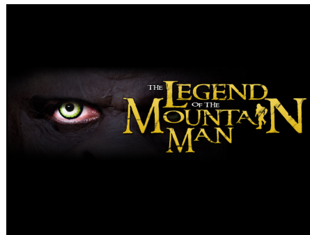
ASL Films "The Legend of the Mountain Man"

This phase of Maine's VP project adds to the accessible services already available at CareerCenters. The next phase will be to start putting VP's in other public places – such as the Capitol, airports, and hospitals – after the current phase is successful. The DHHLD hopes the CareerCenter VP sites are well-received and the new VP's will help Deaf customers use the many career-related services.