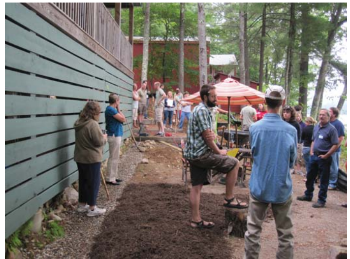
Shoreland Protection Retrofit fieldtrip at headwater lake of the Salmon Falls River

The Collaborative has also found resources to begin implementation of Action Strategy 1 "Assist watershed municipalities, land trusts, water suppliers, and land owners with conserving and maintaining lands most important for producing clean water." Collaborative members approached the USDA-NRCS in both Maine and New Hampshire and, after several meetings and much discussion, the