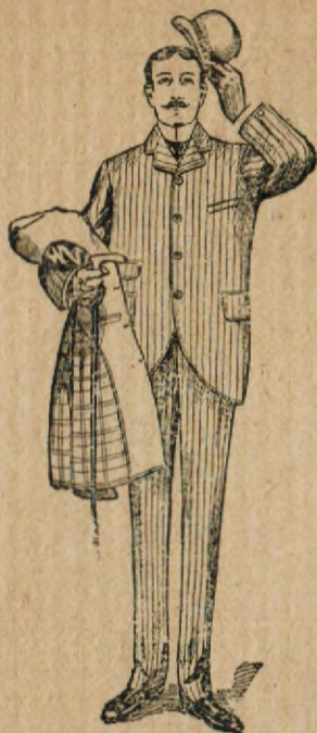
COPYRIGHT, 1900 HART, SCHAFFNER & MARX